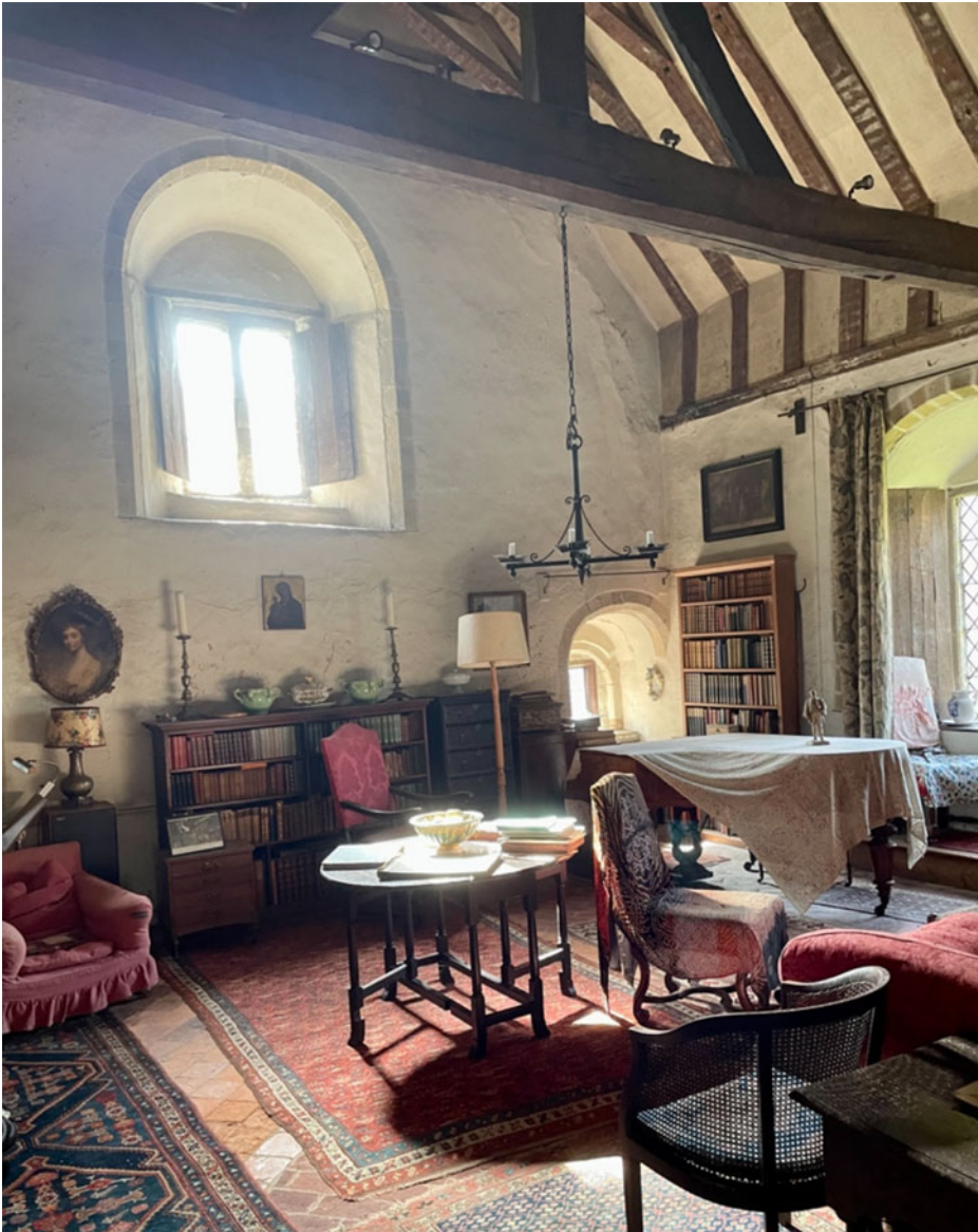
Figure 5. The Prior's Chamber—where the January 1929 party unfolded.