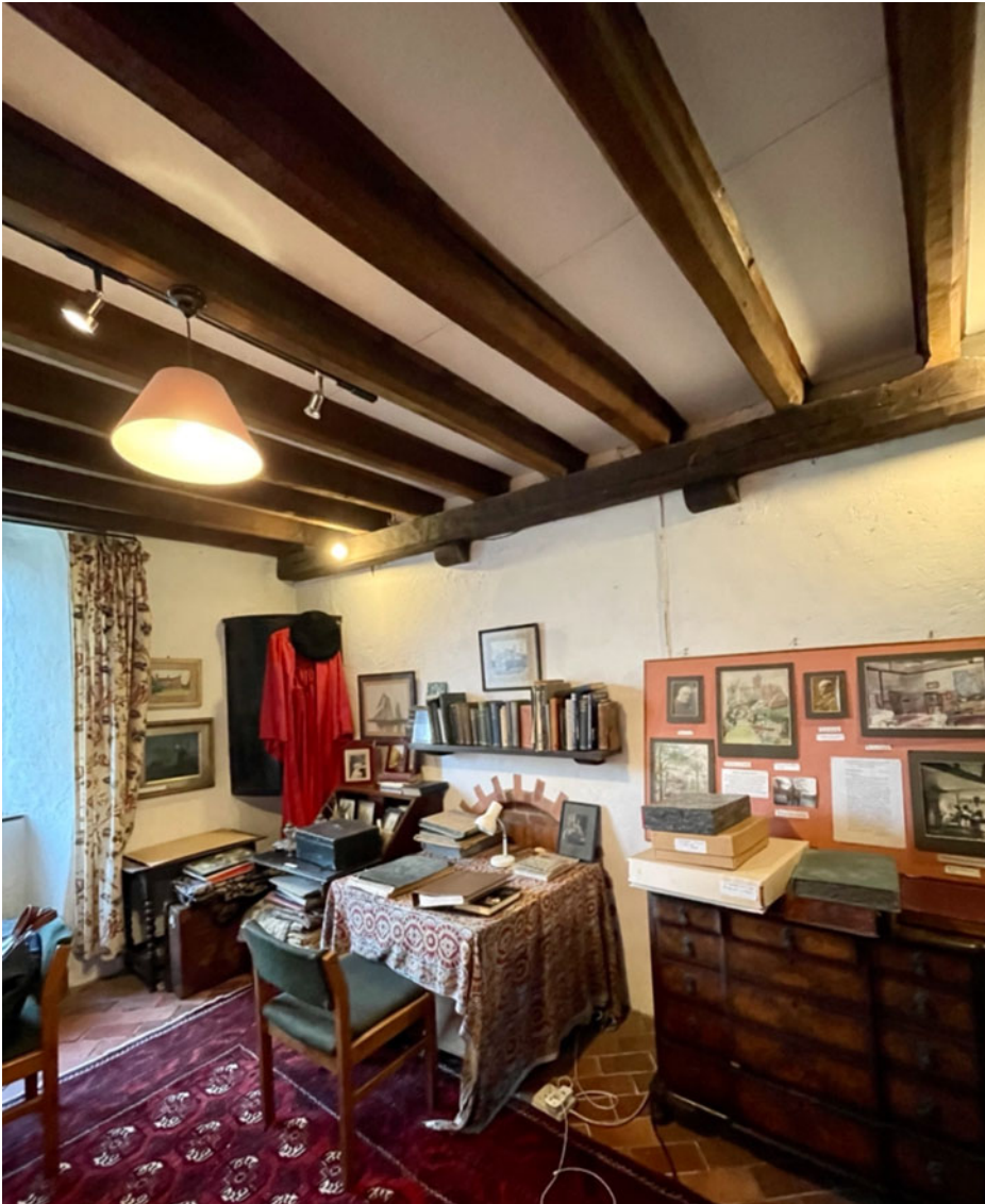
Figure 1. My workspace while at Shulbrede Priory—an upper room adjoining the Prior’s Chamber. The robes were worn by Hubert Parry on receiving his BMus from Oxford.

There is much to be gained in studying the “trivial,” namely, a stronger understanding of the history of everyday life. We see, also, in these histories the traces of our contemporary interest in wealth and celebrity, attempts at understanding the persistence of elite power structures, and lingering fascinations with the “long-weekend” that was the 1920s. 3 March 2020, for instance, saw the opening (and untimely pandemic-related shuttering) of an exhibition of Cecil Beaton photography titled “Bright Young Things” at the National Portrait Gallery, London. Claridge’s would relaunch their cocktail program to feature a “Mixing with the Bright Young Things” menu to coincide with the exhibition. The lives of