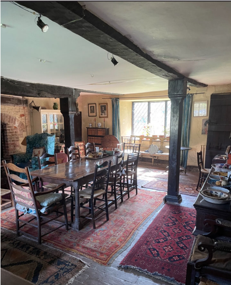
Figure 6. The dining room at Shulbrede Priory.

revealing, and to be able to read about them where they happened is a sublime privilege. What other histories do private homes like Shulbrede hold? And how do we, as historians, gain access to them? And, concerningly, what will become of these archives when they lose their caretakers (Figure 6)?