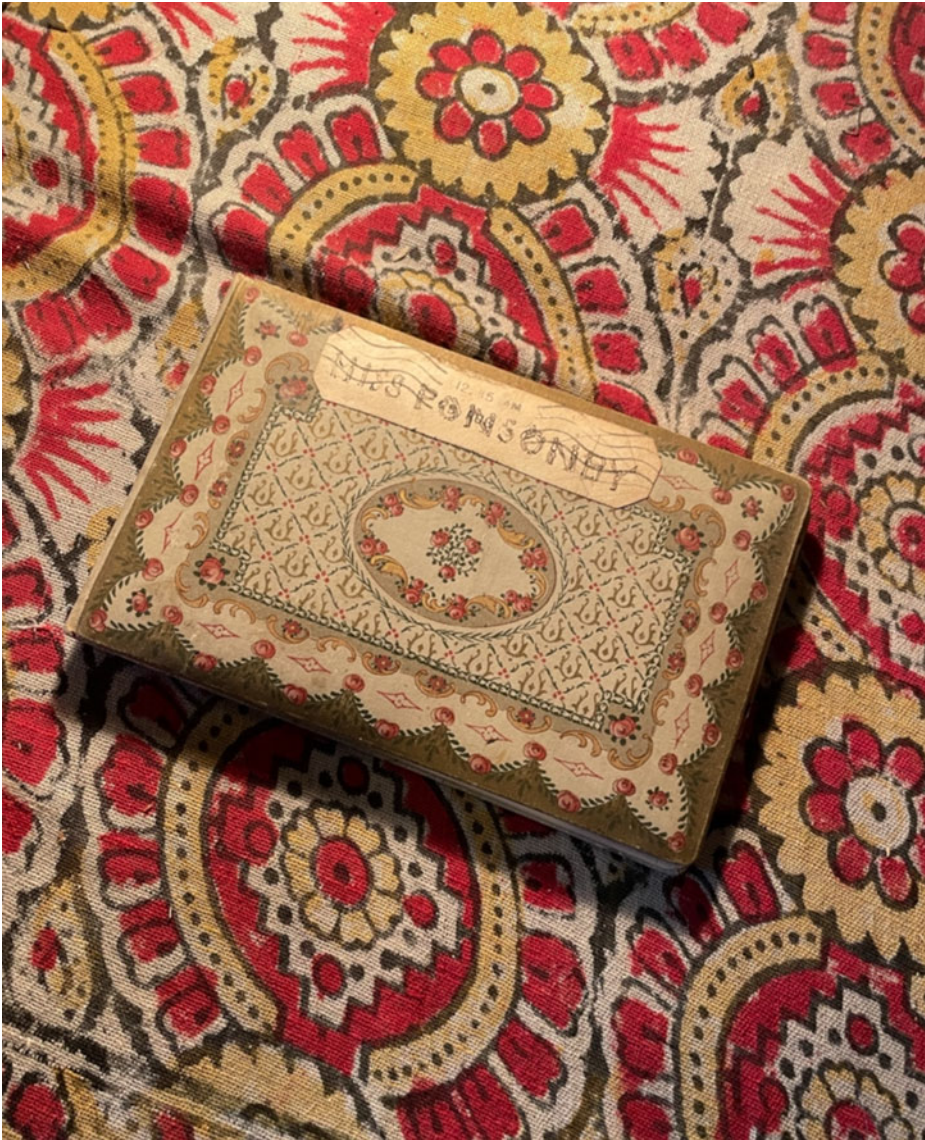
Figure 2. Scrapbook labelled “Miss Ponsonby.”

the rich were fascinating to readers of the interwar gossip column, and it seems that for a broad public they remain so today—how can historians leverage those public interests into professional outputs?