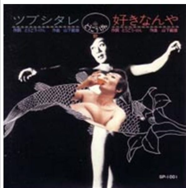
Cover of Tōgō’s single Suki nan’ya (It’s because I like you) released from the album Baramon .

Sajiki Company “formed by poet, film maker, boxing fan and all-around agent provocateur Terayama Shuji”. 17 Tōgō even featured as singer on one of the tracks on a compilation of gay-themed songs Baramon (Gate of roses) produced by the company in 1972. No doubt influenced by Terayama’s provocative use of sexual imagery and language in his theater productions, Tōgō brought politics into the world of the “ gei bōi ” 18 and the figure of the gei bōi into politics.