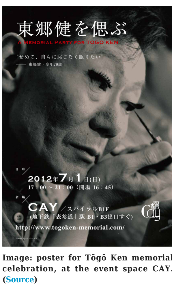
Image: poster for Tōgō Ken memorial celebration, at the event space CAY.

Tōgō was revolutionary in articulating the political nature of sex. The Japanese term for “politics” is seiji 政治, written with a combination of two different characters meaning government. Tōgō pointed out the way in which sexuality was also invested in politics and politics in sexuality by replacing the first character of seiji 性治 with the homophonous character sei 性 designating sex. As he frequently argued, the Japanese family system which requires one man and one woman to come together in a joint project to produce and manage children is considered “normal” ( seijō ) simply because this is the form of family most easy to govern within the context of capitalist society.