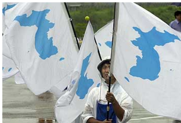
The unification flag used since 1991

During 2007 formal inter-Korean talks on a joint Olympic team took place in Kaesong in February, with more informal contacts in Kuwait in April and in Hong Kong in June 2007, but no solution was achieved. There is considerable agreement on issues such as the flag (the unification flag), the national anthem to be played when medal winners are on the podium (the 1920s version of the traditional Korean folk song 'Arirang'), and the uniforms (following earlier designs but all supplied by the South). One key area remains outstanding – and it is an issue that has remained since those early days of the 1960s – how to choose the athletes to compete.