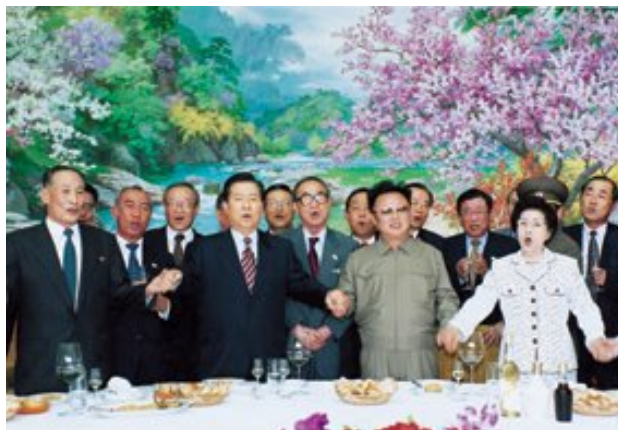
The two Kims and entourage following the June 15, 2000 Joint Declaration

The historic June 2000 summit between Kim Dae-jung and Kim Jong Il, in Pyongyang, opened the way for greater cooperation and collaboration in North-South Korean relations. Consequently, at the 2000 Sydney Olympics the two Koreas entered the Olympic stadiums under a joint flag (the so-called 'unification flag', consisting of a blue outline of the undivided Korean peninsula on a white background) and wearing identical uniforms at the opening ceremonies. It was an emotional moment for Koreans. However, the athletes competed as two separate national teams.