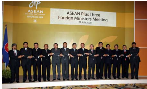
ASEAN foreign ministers meeting, 2008

Relations with ASEAN are important for securing Tokyo's economic leadership in East Asia. Through ASEAN, Japan seeks to maintain its position as the regional economic power and seeks to expand its international political influence in the world. In order to pursue closer relations with ASEAN states, Japan has emphasized soft power diplomacy for a decade. Like China, foreign aid, economic networking and people-to-people contact via social/cultural exchanges are the core of Japan's soft power resources. Tokyo's economic and political contributions toward ASEAN institutionalization and integration have bettered its image among Southeast Asian nations and their people [17].