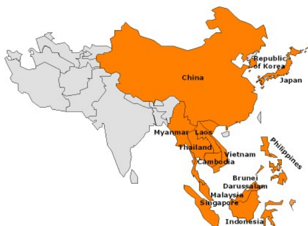
ASEAN + 3

Regional leadership matters. It can facilitate cooperation among states and bring about a prosperous common future. Nevertheless, the struggle for leadership may lead to serious rivalry and regional instability. In East Asia, the quest for leadership has been controversial. Northeast Asian powers such as China, Japan and Korea have long been regarded as potential leaders striving to secure national interests by expanding their influence over their southeast neighbors. However, in the Asian financial crisis of 1997 none of these countries was able to play a dominant role, resulting in a “leadership deficit.”[1] To some extent, the Asian financial crisis did witness a new architecture of collective leadership in East Asia. “ASEAN Plus Three” (APT), inclusive of ten ASEAN member states in addition to China, Japan, and Korea, convened in Kuala Lumpur in late 1997, pointed toward a model of co-governance among regional powers. Based on this framework, the Chiang Mai Initiative (CMI) and Asian Bond Market Initiative (ABMI) resulted in successful responses to the financial catastrophe. Ten years after its inaugural summit, APT cooperation has become the most effective track for regional cooperation.