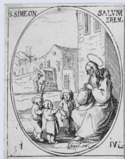
Jacques Callot, Saint Simeon Salus, 17th century.

The life of Symeon contains common features with traditional hagiographical literature with the purpose of showing that the saint was an imitator of Christ. Thus, Symeon gives food to the poor, practises exorcisms and saves people from sins. Nonetheless, he had erratic behaviours unparalleled in other anchorites that constantly provoked public scandals: he ate copiously in taverns, defecated in the streets, practised nudism, entered the baths of women, pretended to rape a woman and walked around being carried and whipped by prostitutes in a sadomasochistic manner. The behaviours described in the life of Symeon could be compatible with severe mental illness, but his reputation made him turn the patron of the mentally ill, whose festivity is celebrated on 1 July. Probably due to the eccentricity of Symeon Salus, there is not an iconographical tradition of him and therefore no devotional images. Calendars are probably the only visual source for Symeon Salus. A 17th-century French calendar illustrates the festivity of 1 July with a beautiful etching by the artist Jacques Callot that lyrically depicts Symeon in the city of Emesa surrounded by children.