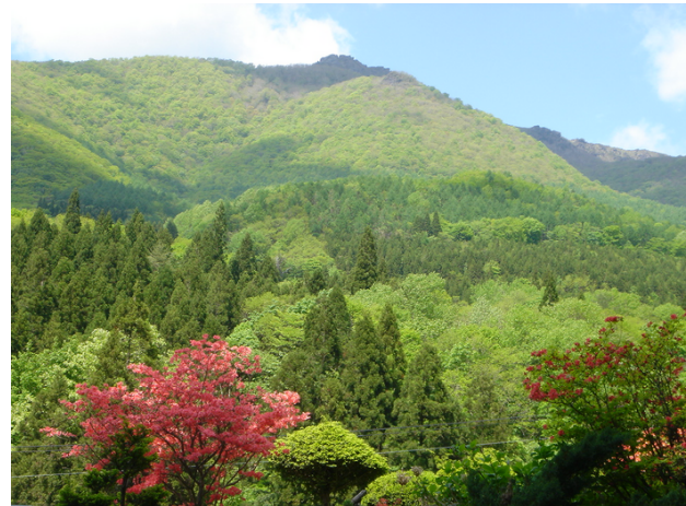
Mixed coniferous and regenerating indigenous forest in Tohoku

Japan's geographical isolation, diverse topography and climate has supported a high level of biological diversity. About 200 mammal species have been identified in Japan, compared to 67 in the United Kingdom and Ireland, an area roughly similar in size. Over 700 bird species, including sub-species, have been recorded, again approximately double the number found in United Kingdom and Ireland (Environment Agency 2000: vol.1, 285; Kellert 1991: 298).