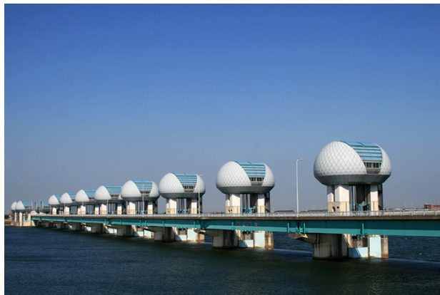
Nagara River, the last major river in Japan to be dammed - then and now. Top: As portrayed by Eisen in the 19th century. Bottom: Now - the “estuary barrage” at the mouth of the river.

The intensive use of agricultural chemicals since the Second World War has caused contamination of soil and waterways, and has made farmland, marshland and other lowland areas uninhabitable for a number of species, causing the extinction of some, including the Japanese crested ibis ( Nipponia nippon ). 7 Fertiliser and pesticide application levels in Japan are higher than those in almost