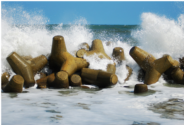
Concrete "tetrapods" on the Fukushima coast, used to minimise erosion

In the same year, the level of pollution of 24 per cent of Japan's coastal waters exceeded environmental standards, and enclosed areas in particular, such as the Seto Inland Sea, Ise Bay and Tokyo Bay are seriously polluted by household and industrial waste (Ministry of the Environment 2007).