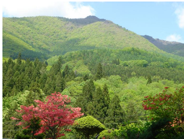
Mixed coniferous and regenerating indigenous forest in Tohoku

Japan's geographical isolation, diverse topography and climate has supported a high level of biological diversity. About 200 mammal species have been identified in Japan, compared to 67 in the United Kingdom and Ireland, an area roughly similar in size. Over 700 bird species, including sub-species, have been recorded, again approximately double the number found in United Kingdom and Ireland (Environment Agency 2000: vol.1, 285; Kellert 1991: 298).