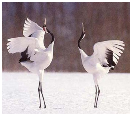
Red-crowned cranes of Hokkaido—the last remaining population in Japan

In addition to the failure to protect areas of ecological importance, direct habitat destruction is a major threat to natural habitats. Habitat destruction has taken many forms: deforestation; land reclamation; construction of dams and other riparian works; use of pesticides on agricultural land; development projects; and pollution.