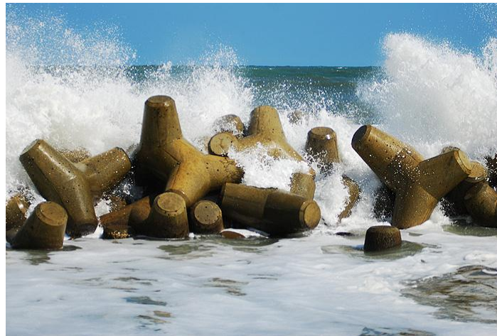
Concrete "tetrapods" on the Fukushima coast, used to minimise erosion

approximately 50,000 hectares (0.13 per cent of Japan's land area), but many of these are threatened by water pollution and land reclamation projects (OECD 2002: 149; Nature Conservation Society of Japan (NACSJ) 2003). Most major rivers have been modified with dams, dykes, concrete embankments, and straightening works. Nagara river, the last free-flowing river in Honshu was dammed in 1994 (McCormack 1996: 46). Only 45 per cent of the coastline of the four main islands remains in an unmodified state – the rest has been transformed by land reclamation, dredging, construction of port facilities, seawalls, breakwaters and other shoreline protection works (OECD 2002: 136, Nature Conservation Society of Japan (NACSJ) 2003). Many of Japan's lakes and rivers are polluted: for example, in 2005, the level of pollution of 47 per cent of all lakes exceeded environmental standards (Ministry of the Environment 2007). In the same year, the level of pollution of 24 per cent of Japan's coastal waters exceeded environmental standards, and enclosed areas in particular, such as the Seto Inland Sea, Ise Bay and Tokyo Bay are seriously polluted by household and industrial waste (Ministry of the Environment 2007).