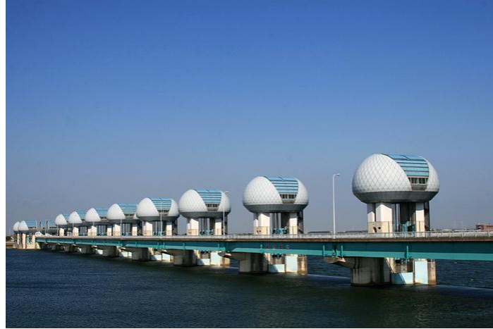
Nagara River, the last major river in Japan to be dammed - then and now. Top: As portrayed by Eisen in the 19th century. Bottom: Now - the “estuary barrage” at the mouth of the river.

The intensive use of agricultural chemicals since the Second World War has caused contamination of soil and waterways, and has made farmland, marshland and other lowland areas uninhabitable for a number of species, causing the extinction of some, including the Japanese crested ibis ( Nipponia nippon ). 7 Fertiliser and pesticide application levels in Japan are higher than those in almost all other OECD countries, partly because of the relatively hot, wet climate and intensive cropping, although it has been decreasing in line with overall reduction of crop production over the last decade (OECD 2002: 139).