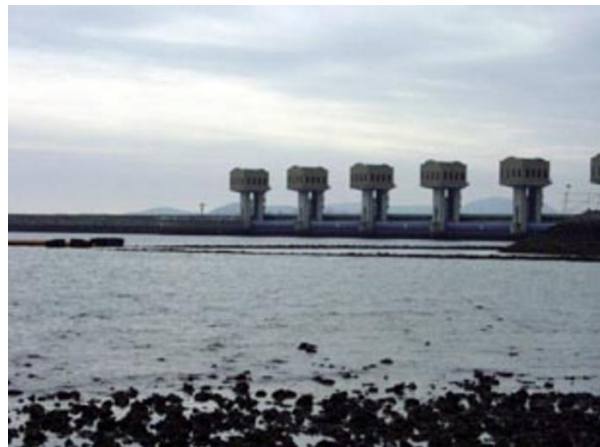
A section of the 7 km long sluice-gate across Isahaya Bay

Tidal-lands are vital buffers between the land and sea and are habitats supporting high biological diversity. The Isahaya Bay tidal land was also an important stopover point for birds migrating between Siberia and Australasia. It made up six per cent of Japan's remaining tidal-land, and was habitat to about 300 species of marine life, such as the mud-skipper ( mutsugorō ), and approximately 230 different species of birds, including a population of Chinese black-headed gulls, of which only 2000 are estimated to remain worldwide (Umehara 2003).