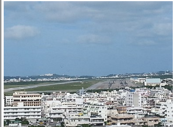
Futenma air station, surrounded by homes and businesses.

The directive states that AICUZ programs are required for bases within the US and its territories and possessions, and that they “may be developed” at bases in foreign countries. That means they are not required. But at MCAS Futenma an AICUZ program exists, though for “noise study only”. (appendix [b]) As for clear zones, the aerial photograph above shows that MCAS Futenma has adopted the perfect bureaucratic solution: the requirement to have clear zones has been met by simply designating two areas (largely off the base) as “clear zones” while doing nothing actually to clear them. This, presumably, is what shocked the not easily shockable Donald Rumsfeld. Every USMC Air Facility inside the US has clear zones entirely within the base. Futenma base isn’t large enough to do that.