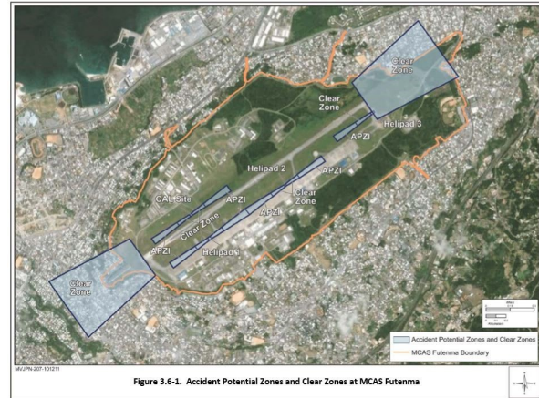
Figure 3.6-1. Accident Potential Zones and Clear Zones at MCAS Futenma

In 2003 then US Secretary of Defense Donald Rumsfeld flew over Marine Corps Air Station (MCAS) Futenma, Okinawa, looked down, and declared it to be “the most dangerous base in the world.” Of course there are many bases, including some in war zones, that could contest that honor. The question is, what did Rumsfeld see that shocked him into making this extreme statement? He saw an airstrip smack in the middle of a crowded city, with residences, parks, schools, businesses, right up to the fence.