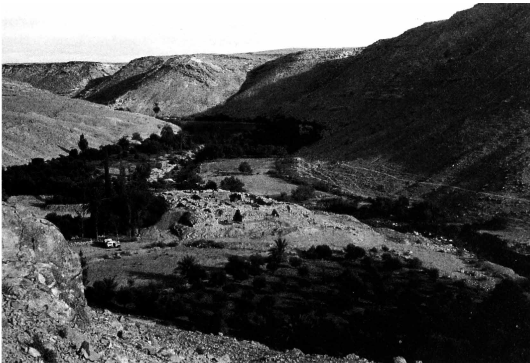
Figure 3 The valley of Ain el Qudeirat with the tell in the center of the picture