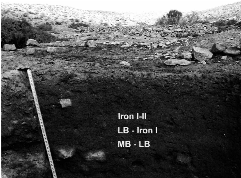
Figure 4 Terraced field 12 in the eastern wadi of Horvat Haluqim, Area 5, showing the anthropogenic soil and the ^{14}\text{C} -dated layers in terms of archaeological periods, associated on the basis of time.

The stratigraphic profile in Area 5 of the anthropogenic soil yielded a number of spots with larger concentrations of this charred organic matter that could be sampled for ^{14}\text{C} dating. Five samples gave dates that are mainly situated in the 2nd millennium BCE (Table 1), covering a total time range of about 1550–950 BCE. Three dates derived from the base of the anthropogenic terrace soil are even older! Their ages and ramifications will be published elsewhere, indicating that runoff agriculture and the application of organic fertilizers to the soil of agricultural terraced wadi fields in the central Negev Desert began unexpectedly early in time.