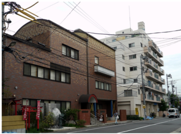
Center of the Tokyo Air Raid and War Damages, Koto Ward