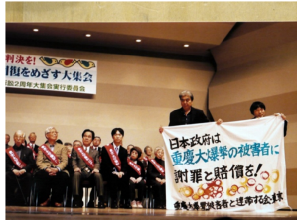
Supporters of a lawsuit demanding an apology and compensation to victims of Japan’s air raids on Chongqing, China.