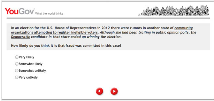
FIGURE A1: Example of survey experiment as it appeared to survey respondents. Note: Figure A1 provides an example of what a respondent who received the Democratic condition for candidate’s party and the Female treatment for the gender cue would have seen when taking the survey.