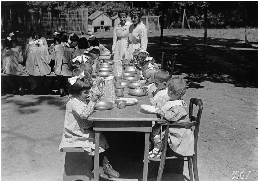
Figure 1.4 Luncheon under the trees at La Jonchère, 1918.