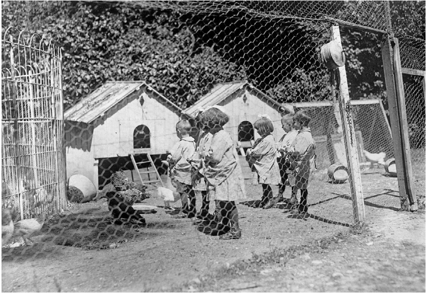
Figure 1.3 Orphaned children feeding chickens at La Jonchère, 1918.