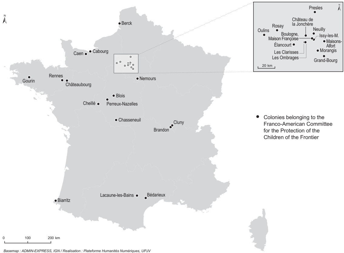
Map 1.1 The twenty-nine colonies for orphans and displaced children opened across France by the Committee Franco-American for the Protection of the Children of the Frontier during World War I.