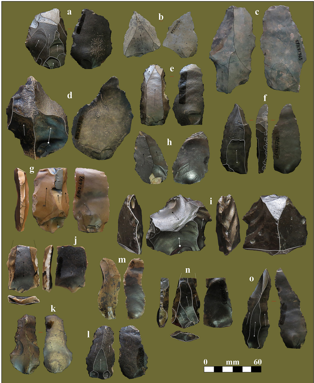
Figure 2. Selected lithics from Eyvanekey: a–l) attributed to Middle Palaeolithic; a, c–h & l) pieces with basal trimming for hafting(?) with e and g being sidescrapers and f being a convergent scraper; b) Levallois point; i) atypical Levallois flake core; j) elongated Levallois point(?); k) sidescraper on an atypical blade; m–o) attributed to Upper Palaeolithic, artefacts made on blades with negative bladelet scars (figure by authors).