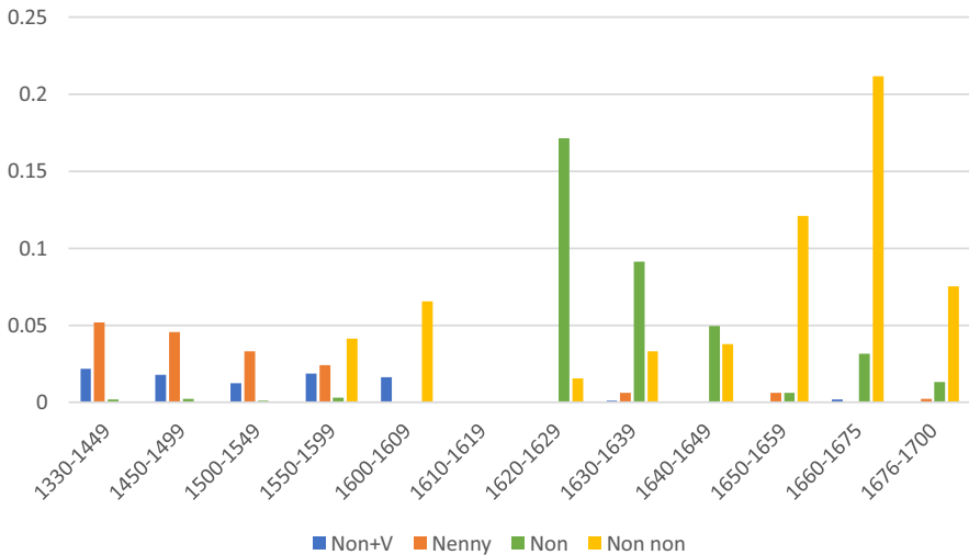
Figure 1. Normalised frequency of non + V , nenny , non , and non non between 1330 and 1700

use of non + V is more or less stable until 1610, when it disappears as well. The emergence of non non is rather strong in the middle of the 16 th century, compared to the old markers' frequency. The presence of non non increases progressively until 1660–1675, when it reaches its peak. Before 1626, the frequency of bare non is very low, and there are no occurrences between 1600 and 1625 indeed. Then, between 1626 and 1629, its frequency increases drastically, and decreases progressively