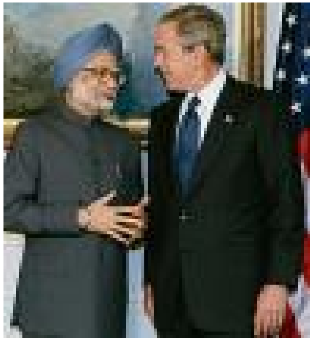
U.S. Assistance, Indian Indigenization, and

Cooperation Group (HTCG). The United States committed to signing a Science and Technology Framework Agreement, to building closer ties in space exploration, satellite navigation and launch, facilitating a U.S.-India Working Group on Civil Space Cooperation, and to removing certain Indian organizations from the Department of Commerce's Entity List. Most notably, the United States agreed to seek adjustment of U.S. laws for full civil nuclear cooperation and trade with India, including reactor fuel supplies, and to consult with its partners on India's participation in the International Thermonuclear Experimental Reactor (ITER) and in the Generation IV International Forum.[6] These proposals are under debate in the U.S. Congress and will require amendment of the Atomic Energy Act of 1954 and the Nuclear Nonproliferation Act of 1978, as well as the acquiescence of the Nuclear Suppliers Group (NSG) before full cooperation begins.[7] This time lag offers an opportunity to reflect on the impact of dual-use cooperation on India, China, and ultimately the United States.