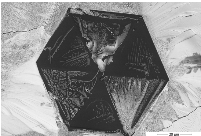
Figure 2. BSE image of an alumina hexagonal grain with monazite entrappedments, surrounded by large monazite grains and eutectic-like structures.