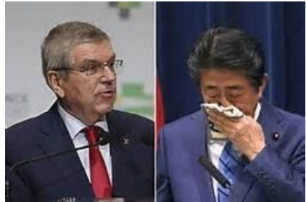
IOC Chairman Thomas Bach and PM Abe Shinzo