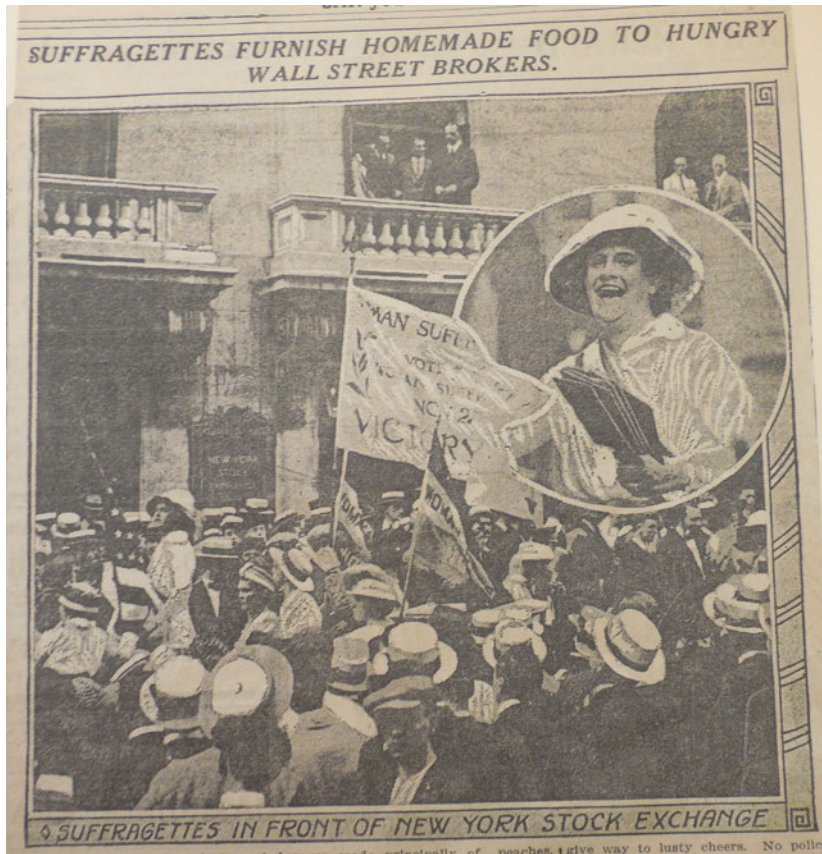
FIGURE 3. “Suffragettes Furnish Homemade Food to Hungry Wall Street Brokers,” San Jose Mercury Herald , 1915, Susan B. Anthony Ephemera Collection, clippings, volume 16, Huntington Library. Suffragists in 1915 made headlines for furnishing “Homemade Food to Hungry Wall Street Brokers.” Operating out of a restaurant and multiple lunch wagons, “suffrage sundaes, cooling beverages made principally of peaches, were handed right and left” and “the suffrage dainties vanished almost immediately.” The food “caused such a stir among the brokers that Wall street was alive from 11 o’clock till 5 with animated capitalists.” Men not only followed their stomachs to the lunch wagons, they also crowded the tables and spilled into the street listening to suffrage speakers.

rival even the meals that ‘mother used to make.’” By dividing up the menu and competing to create better dishes, the women of the Atlanta Equal Suffrage Association refuted “the argument of the antis that women who seek the ballot are remiss as housekeepers and as cooks.” 134 Suffragists emphasized dainty dishes, suffrage savories, and mothers cooking and intentionally played into gender expectations that said women possessed an inherent interest and skill in crafting comforting meals. Suffragists’ embrace of domesticity, however, was not accidental or ruinous to their cause. By entering public spaces with practical demonstrations of their cooking in hand, suffragists proved their compliance with gender expectations and, at the same time, insisted on their right to the franchise.