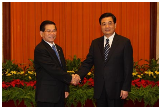
Vietnamese President Nguyen Minh Triet (L) and

China and Vietnam have outlined new steps to resolve their long-running territorial disputes in the South China Sea in an effort to avert further conflict and put their relations on a steadier footing for the future. Although both countries are ruled by Communist parties and share extensive land and sea borders, they have had a tense relationship. But they now face political challenges at home as their export-oriented economies and investment slow under the impact of global financial turmoil and deepening recession. They have evidently decided to give primacy to strengthening bilateral party, trade and investment ties to offset the wider economic downturn.