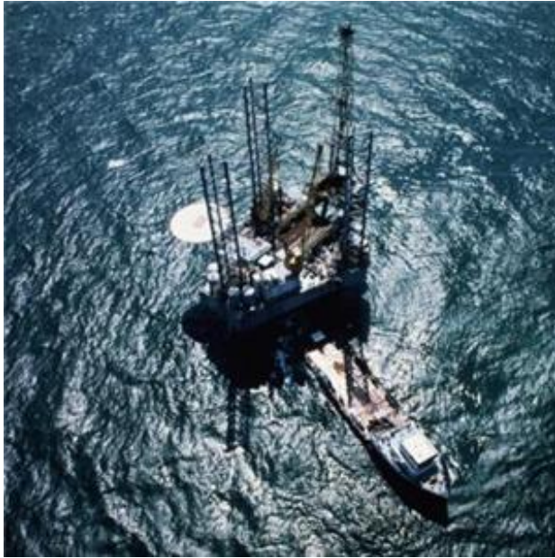
China National Petroleum Company offshore oil rig

As Southeast Asian governments and the energy companies working for them push deeper into the South China Sea in their hunt for more gas and oil, they can only hope that China's southward push will lead to better cooperation, not confrontation. China has handed out exploration contracts or production licenses over most of its deepwater oil and gas blocks in the South China Sea south of Hong Kong. These are contested only by Taiwan. [8] However, future Chinese permits seem set to overlap with those from its Southeast Asian neighbors (Reuters, November 2, 2007). Unlike in the 1980s or 1990s, China may now have the military power to enforce its territorial claims against rivals in the region, should it decide to do so. But at what cost to its international