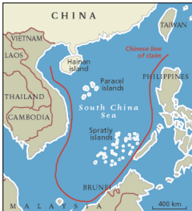
Chinese claims in Spratley Islands area

In the Spratlys, the armed garrisons that all the claimants (except Brunei) have stationed on the tiny dots of land they say are theirs are still in place and, in some cases, have been reinforced. A code of conduct for the South China Sea, signed by Beijing and ASEAN (the Association of South East Asian Nations) in 2002, is voluntary. A joint seismic survey of hydrocarbon resources, agreed in 2005 by the national oil companies of China, Vietnam, and the Philippines, lapsed last July and may not be renewed. Even when it was operational, the tripartite seismic survey did not include the other three Spratly Island claimants. Moreover, it covered only a small part of the contested sea area.