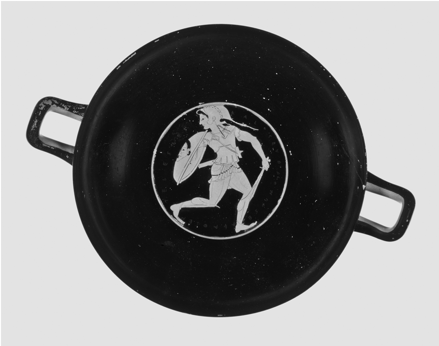
FIGURE 36: Munich, Antikensammlungen 8953, red-figure cup, signed by Euphronios, BAPD 6203.

warrior runs to the right, looking back over her shoulder, at an (unseen) pursuer. It is a female warrior, to judge from the absence of beard and presence of long wavy locks of hair. Around the inside of the tondo is the signature \text{E}\ddot{\upsilon}(\varphi)\rho\acute{\omicron}\nu\acute{\iota}\omicron\varsigma \xi\gamma\rho\alpha\varphi\sigma\epsilon\nu , “Euphronios painted [this].” 15 With respect to handedness, what is striking about the image is that the Amazon carries her sword in her left hand and her shield in the right. That is an anomaly, for “there exist no heroes in Greek art who are southpaws,” as Takashi Seki memorably remarked. He took the picture to be the result of an unintentional error in drawing. 16 The picture of the left-handed Amazon, however, is not unique. A cup in Bochum attributed by Beazley to a follower of Euphronios, the Hermaios Painter, also depicts an Amazon running to the right, looking back, torso seen from the front, sword in the left hand, shield in the right. In her publication of the cup in Munich, Martha Ohly-Dumm argued that it was the model for the cup in Bochum. 17