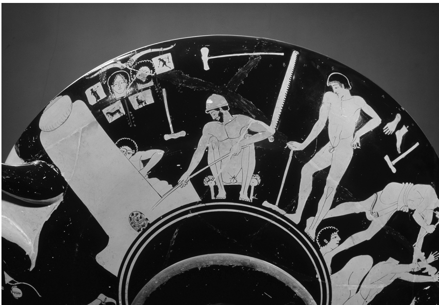
FIGURE 43: Berlin, Antikensammlung, F2294, red-figure cup, ARV 2 400,1, Foundry Painter, BAPD 204340. Obverse.

On the exterior of the cup (figures 43–44), there is another representation of an artisans' workshop, a bronze-sculpture foundry. In this case, however, the artisans appear to be contemporary, not mythical. Several steps in the creation of large-scale bronze statues are represented, from the melting of metal in a kiln, and the piecing together of a statue of an athlete, to the final polishing of