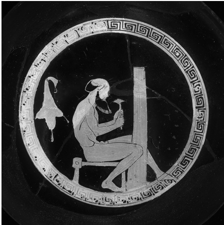
FIGURE 48: Boston, Museum of Fine Arts, 62.613, gift in memory of Arthur Fairbanks, red-figure cup, ARV 2 1701,19bis, Antiphon Painter (or manner of), ca. 475 BC. BAPD 275647.

the cup in Boston, the metalworker sits on an uncomfortably low, utilitarian stool. He wears no clothing at all. His accouterments—a furnace, cauldron, anvil, and metal files—belong exclusively to the manufacturing district of the city. By comparison with the depicted metalworker, the fictive vase-painter appears to have a place in two social worlds, that of skilled labor and the world of leisure. A third cup by the Antiphon Painter or in his manner depicts yet another craftsman (figure 48). 60 This cup depicts a sculptor or stone-cutter, carving the flutes into a column. He sits on a low stool. Like the two other craftsmen, the stone-cutter is outfitted with an accessory that contributes to his characterization. This craftsman's attribute is a skin filled with wine, because this craftsman, as revealed by his ear,