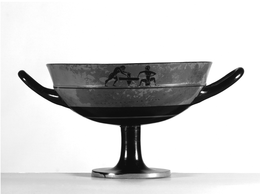
FIGURE 45: Karlsruhe, Badisches Landesmuseum, 67.90, black-figure cup, BAPD 355, manner of the Centaur Painter. Obverse.

The relaxed air of the men leaning on sticks, whiling away the day watching other men work, is highlighted by the squatting position of some of the workmen. The position is motivated, in part at least, by their tasks. But the image of a figure squatting on the ground, particularly when the figure is shown frontally, so that the genitalia are visible, also appears to have connotations of social inferiority. The idea is suggested, for example, by the juxtaposition of two scenes of a potter's workshop on a lip cup in Karlsruhe dating to the third quarter of the sixth century (figures 45–46). 54 On one side of the cup, a potter shapes a cylinder of clay into a vase on a potter's wheel. The wheel is turned by a boy, buck naked like the potter. The boy sits on a low block, his body oriented frontally toward the viewer, his legs spread, genitalia prominent. This exact pose is not necessitated by the depicted action, for the wheel-turner could have been shown in profile view. On the other side of the cup, the manufacture of the kylix is complete; it is a Little Master cup, in shape similar