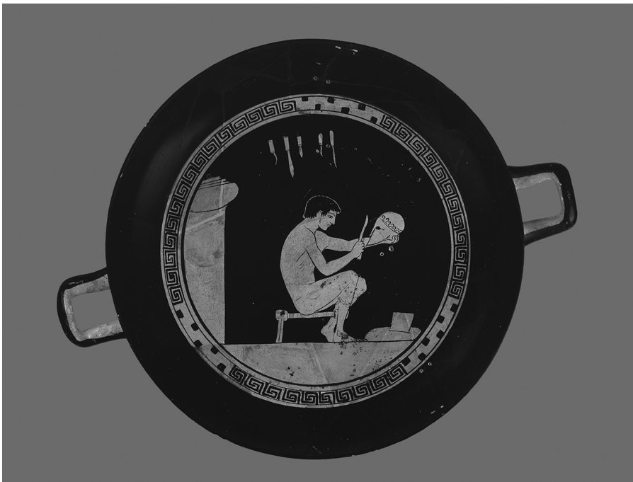
FIGURE 47: Oxford, Ashmolean Museum, G267 (V518), red-figure cup, ARV 2 336,22, Antiphon Painter, BAPD 203459.

For the identification of the expectations that attended the creation and reception of the cup in Boston (plate XVIII), there are two sources of information. One is other vase-paintings. Thanks to happy accidents of survival, it is possible to compare the imagery on the cup in Boston to other vase-paintings, similar in composition or subject, by the same artist or circle of painters. The comparison shows that the Antiphon Painter is capable of creating scenes of “daily life” that are contrary to fact. A contemporary cup in the Ashmolean Museum also attributed to the Antiphon Painter depicts a craftsman in a related field, a metalworker (figure 47). 59 In contrast to the vase-painter depicted on