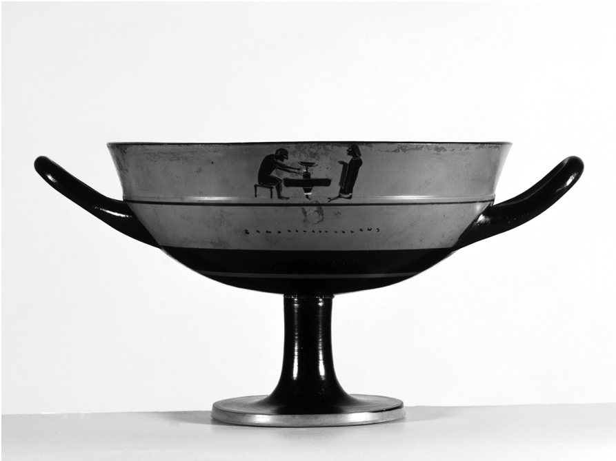
FIGURE 46: Karlsruhe, Badisches Landesmuseum, 67.90, black-figure cup, BAPD 355, manner of the Centaur Painter. Reverse.

to the vase on which its picture is painted. The potter, who is seated on a stool before the wheel, is perhaps applying glaze to the foot of the cup. Once again, the potter is nude. Standing before him, in the place where the boy sat and turned the wheel, is a heavily draped male figure, with one hand extended. He is the one figure in either image on the cup who is not directly involved in the production of the vase, yet his attention suggests that he is interested in it. Perhaps he is contemplating making a purchase of the depicted cup for use at his next symposium. Turn the cup around and around: the visible contrast in posture and dress between the pot-purchaser and the wheel-turner seems deliberate and pointed. Presumably, the differences are rooted in the socioeconomic differences between working in a pottery shop and participating in sympotic culture. 55