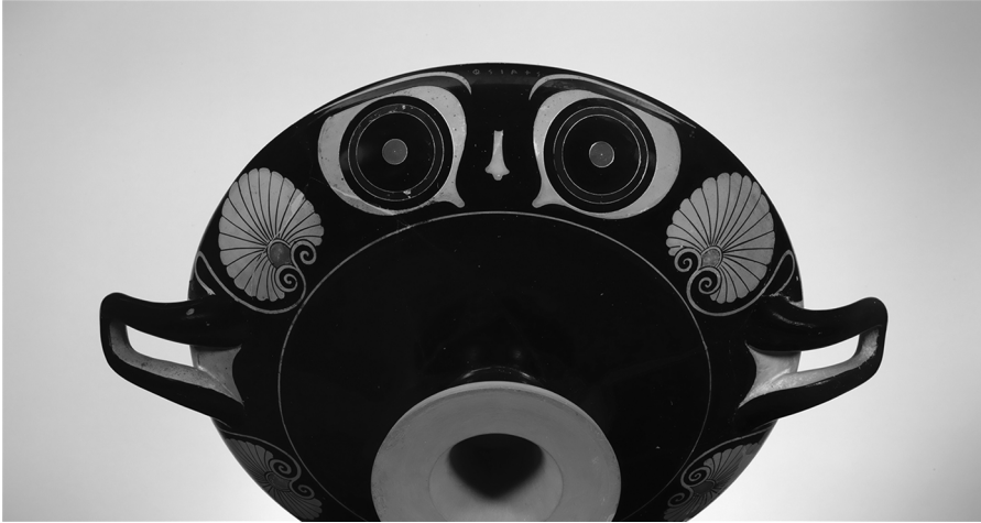
FIGURE 35: New York 14.146.2, red-figure eye cup, ARV 2 9,1, perhaps Psiax, BAPD 200038. Rogers Fund, 1914.

vase-painting is a label identifying a represented figure. Typically, the inscribed name begins at the head of a figure, who is represented in his/her entirety on the body of a vase (e.g., plates I, III, and many others in this book). In the case of the two cups bearing the name “Psiax,” however, there is no represented figure of the usual type—that is, “within” the figural world of the vase-painting—in the vicinity of the inscription. There is just the pair of eyes and nose of the face of the eye cup itself. In this case, the name “Psiax” begins not adjacent to the head of the represented figure, but within the space of the head itself.