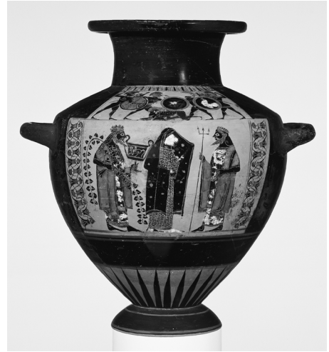
FIGURE 41: Malibu, J. Paul Getty Museum, Villa Collection, 86.AE.113, black-figure hydria, wider circle of Lydos, ca. 550 BC. BAPD 79.

terminology, a “vente.” On the body of the depicted kantharos, carefully bounded by pairs of incised horizontal lines, is an incised design of a horse and rider. Where would Dionysos have acquired a vase of such splendor? The parallel story of the origins of the golden amphora-urn of Achilles—originally a gift from its creator Hephaistos to the god Dionysos in thanks for hospitality on Naxos—points to Hephaistos as the source of the magnificent kantharos of Dionysos. But the figural decoration of horse and rider is among the most popular motifs in contemporary Athenian black-figure vase-painting. The figural decoration collapses the distinction between Hephaistos’ divine creations and contemporary, artisanal pottery and vase-painting. 35