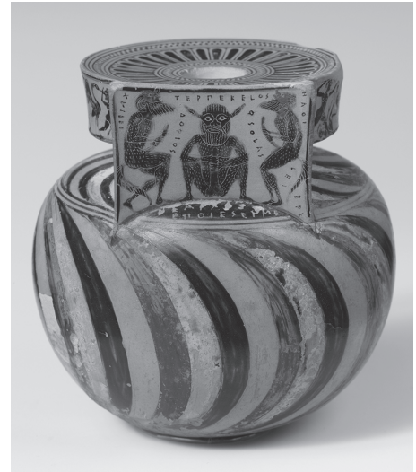
FIGURE 34: New York 26.49, black-figure aryballos, ABV 83,4, attributed to Nearchos, BAPD 300770. Purchase, The Cesnola Collection, by exchange, 1926.

How this imaginative engagement with a viewer works in detail was lucidly explicated by Richard Wollheim. There is a fundamental distinction, he posited, between a spectator of a picture and a spectator “in” a picture. The spectator of the picture (or external spectator) occupies the space where the work of art is to be seen, such as an ancient symposium or modern museum. By internal spectator, Wollheim means an imaginary figure whose presence and identity or character is implied by the action(s) and gaze(s) of the painted figure(s). The internal spectator shares the virtual space inhabited by the other figures within the representation—but happens not to be visible to us within the “slice” of the virtual space given to us by the picture. 2 A powerful example is provided by Velázquez’ Las Meninas (plate II) with which this book began: the Infanta Margarita, Velázquez, and several other figures in the painting have paused to acknowledge visually the presence of the king and queen of Spain. The king and queen are not depicted within the painting, but it is clear from the actions of the figures within the painting that the royal couple occupies a position more or less identical with that of any viewer of the picture. In trying to figure out