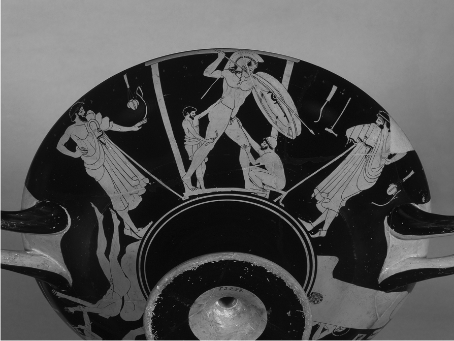
FIGURE 44: Berlin, Antikensammlung, F2294, red-figure cup, ARV 2 400,1, Foundry Painter, BAPD 204340. Reverse.

an over-life-size statue of a warrior. The vase is among the most detailed of any representation of artisans in Greek art. 47