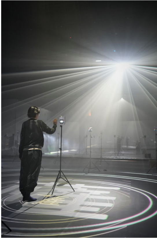
FIG. 1 Temperature monitors reflected and multiplied on the mirrored walls of the Studio Theatre in Bach Is Heart Sutra . May 2021. Cultural Centre, Hong Kong.

reminder of the pandemic and the proliferation of biometric technologies brought the city inside the theatre. Images of densely packed skyscrapers and the sea waves surrounding them were projected on the floor, bringing the city further into the space and evoking the physical topography of Hong Kong as an archipelago of over 200 islands. There was a feeling of being embodied by the city, rather than occupying it as an external environment.