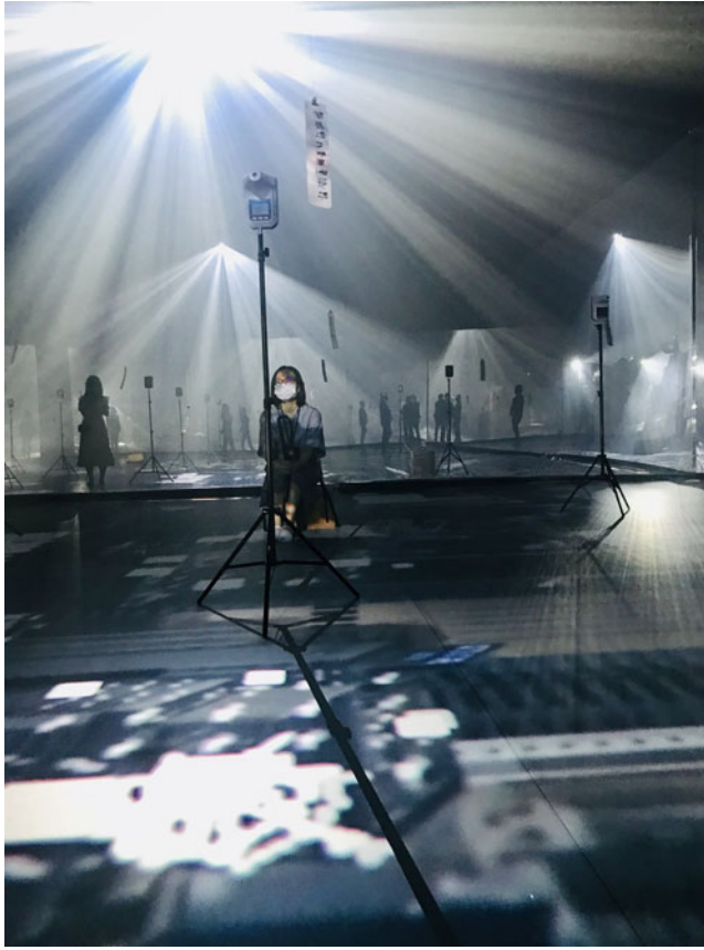
FIG. 2 Chinese characters written on fabric reading 'Emptiness is form, form is emptiness', with their digital counterparts projected across the theatre space in Bach Is Heart Sutra . May 2021. Cultural Centre, Hong Kong.

deny the existence of the words, concepts and ideas that organize our relationships with each other and with the world. Rather it means that 'we don't get caught up in their appearance'. 32 Signlessness empties signs of their appearance of solidity and separateness and sees instead interbeing. When seen with eyes of signlessness, for example, a piece of paper becomes the trees, sunlight, soil, rain and labour that go into its existence. Likewise, all objects are transformed from solid forms, singular identities and stable concepts into expressions of interdependent co-arising. 33