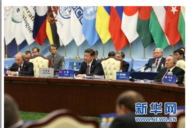
CICA 2014 plenary with Vladimir Putin (left) and Xi Jinping (center).

What President Park probably most wanted to hear from Xi was a strong commitment to pressing North Korea on nuclear weapons and ballistic missiles as a condition of resumption of diplomatic engagement. As is by now well known, discussion in Beijing has turned from consistent support of Pyongyang on the nuclear issue to concern about how Pyongyang's behavior might hurt PRC interests. But China's public position had already been established when Xi Jinping spoke in May to the 24-member Conference on Interaction and Confidence Building in Asia (CICA), a four year old Chinese diplomatic initiative. 9 That group embraces most Asian as well as Middle East countries.