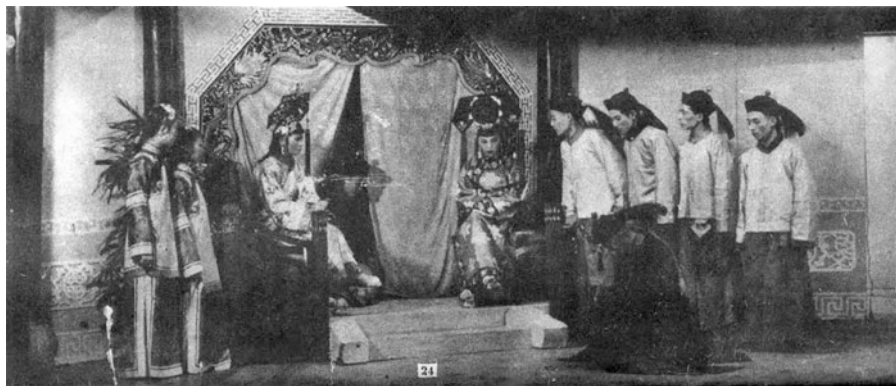
FIG. 1 The play Cixi taihou (Empress Dowager Cixi) identified as tongsu huaju (popular spoken drama). From anonymous, 'Difangxi' (Regional Operas), Dalu huabao (Grand China), 1, 1 (1949), pp. 24–25, here p. 24. Every effort has been made to secure necessary permissions to reproduce this image; however it has not been possible to trace the copyright holder. If any omissions are brought to our notice, we will be happy to include appropriate acknowledgements