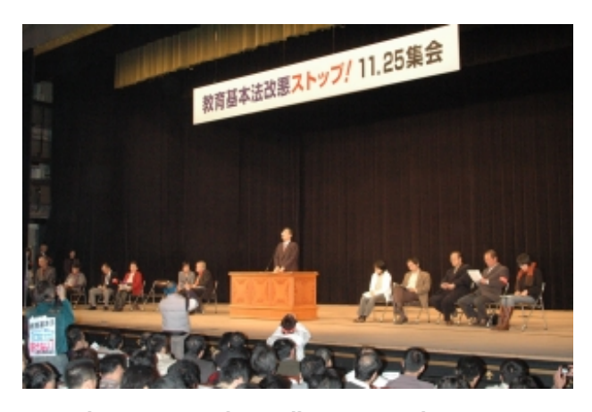
November, 2006 Teachers rally to oppose the revision of the Fundamental Law of Education

Educational reform, however, inevitably rings extra alarm bells in Japan, where many still remember that schools were once little more than the junior wings of the military. The Japan Times reminded its readers after Mr. Abe's speech that the original 1947 Law was based on the determination "of the Japanese state not to repeat the mistake of creating the ultranationalist, state-centered education system of World War II and before." In June it said the new education bills were "yet another means to strengthen state control."