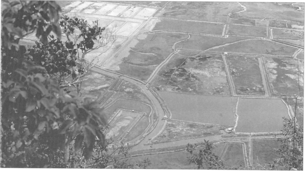
The influence of a few wealthy landlords as well as a number of local government officials, has resulted in a patchwork of illegal shrimp farms occupying most of the low-lying areas within the park. This photograph, taken from a hilltop, shows the freshwater marsh in the south-western part of the park.

unsuitable for farming. At the request of the National Committee on Wildlife and Natural Resources, 39.5 sq km of the marsh was annexed to the park area in 1982 and the rest was put under the responsibility of the province to provide farmland for the villagers.