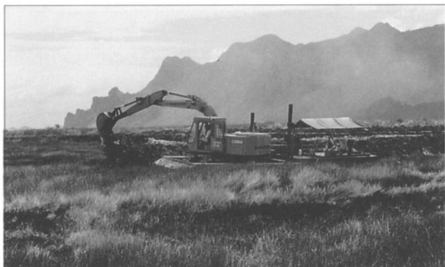
Weak law enforcement by individual park superintendents has contributed to the blatant conversion of the marshland habitat.

six bulldozers, which belonged to a local businessman and which were operating illegally inside the park. However, this confrontation culminated in a visit by the then Deputy Minister of Agriculture, who lived close to the park and who was a friend of the businessman, flying in by helicopter to undermine the park's authority.