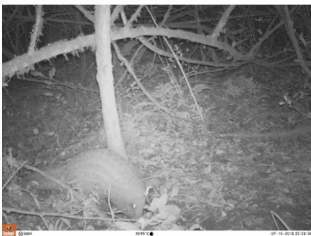
PLATE 1 Giant pangolin Smutsia gigantea photo-trapped in an Afromontane forest in western Kenya, on 19 July 2018 at 22.28.

a camera-trap survey conducted in July 2018 in a primary highland forest in Kenya's Rift Valley region, in which a giant pangolin was captured in a single event (Plate 1). The presence of the giant pangolin in this location potentially makes it sympatric with Temminck's pangolin, a species with which the giant pangolin can be confused because of their morphological similarities (Hoffmann et al., 2020). Although the area where the image was captured is within the defined range of Temminck's pangolin (Pietersen et al., 2019), to our knowledge there are no confirmed records of Temminck's pangolin from this area nor from rainforest habitats anywhere across its range. Confirmation of this record being a giant pangolin is based upon the habitat type and several physical characteristics: Temminck's pangolin is considerably smaller than the giant pangolin (up to 140 cm in total length and weighs up to 21 kg; Pietersen et al., 2019), and a blue duiker Philantomba monticola