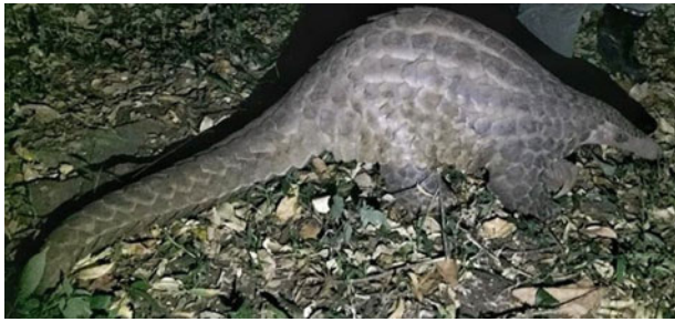
PLATE 2 Giant pangolin photographed by the side of the road on the edge of the savannah–Afromontane belt in western Kenya, in July 2018.

captured in the same position on the same camera (head and body length 55–90 cm and shoulder height 32–41 cm; Kingdon et al., 2013) provided a size reference. The pangolin recorded here is estimated to be at least 140 cm in length, with the girth, tail length, elongated head and body shape indicative of a giant pangolin. The front legs are relatively long and robust, suggesting the quadrupedal locomotion characteristic of the giant pangolin rather than the bipedal locomotion of Temminck's pangolin, and the scale shape and rows are more consistent with those of the giant pangolin, having a greater number of more rounded scales relative to overall size (Hoffmann et al., 2020).