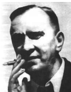
Stefan Banach, 1898–1945

A second source of inspiration was the discovery, in the 1920s by John von Neumann, that the – at that time brand new – theory of Quantum Mechanics can be put on a solid mathematical foundation by means of the spectral theory of selfadjoint operators on Hilbert spaces. It was not until the 1930s that these two lines of mathematical thinking were brought together in the theory of Banach spaces, named after its creator Stefan Banach (although this class of spaces was also discovered, independently and about the same time, by Norbert Wiener). This theory provides a unified perspective on Hilbert spaces