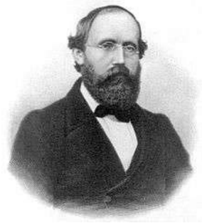
Bernhard Riemann, 1826–1866