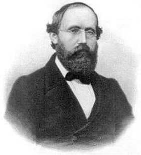
Bernhard Riemann, 1826–1866

Let K be a compact metric space and let \mu be a finite Borel measure on K . We will set up the Riemann integral with respect to \mu for continuous functions f : K \rightarrow X . To this end we need the following terminology. A partition of K is a finite collection of pairwise disjoint Borel subsets of K whose union equals K . The mesh of a partition is the diameter of the largest subset in the partition.