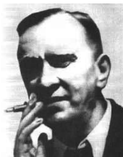
Stefan Banach, 1898–1945

A second source of inspiration was the discovery, in the 1920s by John von Neumann, that the – at that time brand new – theory of Quantum Mechanics can be put on a solid mathematical foundation by means of the spectral theory of selfadjoint operators on Hilbert spaces. It was not until the 1930s that these two lines of mathematical thinking were brought together in the theory of Banach spaces, named after its creator Stefan Banach (although this class of spaces was also discovered, independently and about the same time, by Norbert Wiener). This theory provides a unified perspective on Hilbert spaces