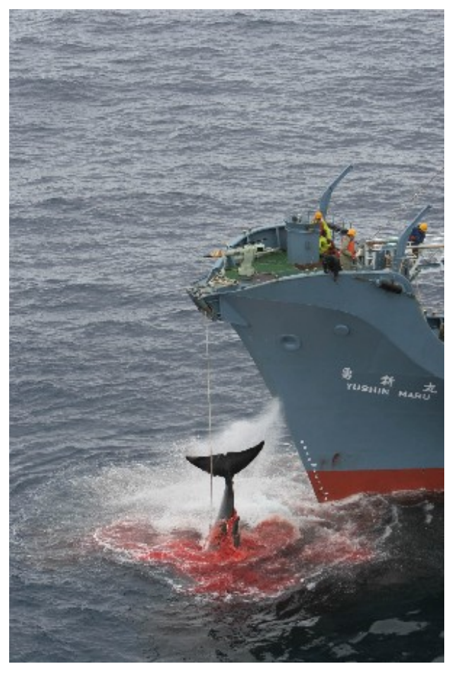
The Japanese catcher ship Yushin Maru harpoons a whale in the Southern Ocean, January 7, 2006.

The whaling issue then is, in the words of one environmentalist, 'a mess.'