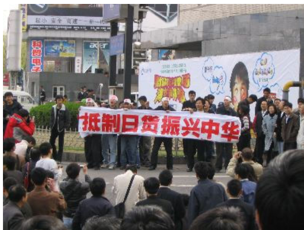
2005 Beijing demonstration calls for boycott of Japanese goods

There is no real public opinion in China. So-called 'public opinion' is all under state control, guidance and manipulation. If public opinion is not welcomed by the government, it will be immediately erased. If an opinion conforms to government views, then it will be encouraged. For instance, the government does not allow any street protest regardless of the reason, yet anti-Japanese protests alone were 'freely' conducted right in front of the military police.