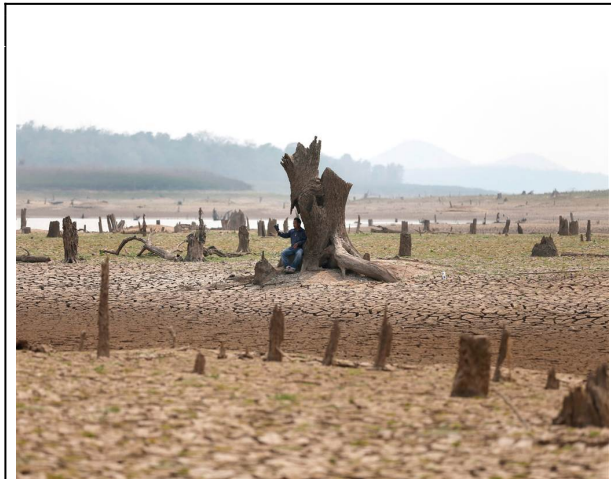
Mae Chang reservoir, Lampang province, northern Thailand, March 2016.

Asia's water woes are worsening. Already the world's driest continent in per capita terms, Asia now faces a severe drought that has parched a vast region extending from southern Vietnam to central India. This has exacerbated political tensions, because it has highlighted the impact of China's dam-building policy on the environment and on water flows to the dozen countries located downstream.