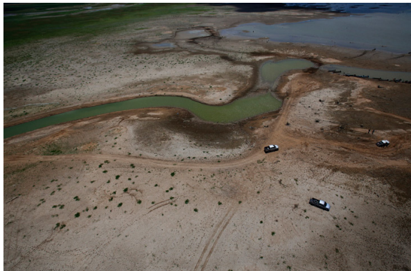
Near Lamtakong Dam, Nakhon Ratchasima, northeastern Thailand.

This drought may be unprecedented, but it is not an anomaly. On the contrary, environmental challenges in Asia, such as ecosystem degradation, groundwater depletion, the contamination of water resources, the El Niño tropical weather pattern, and the effects of global warming are causing droughts to become increasingly frequent - and increasingly severe.