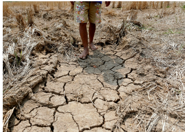
Chachoengsao province, Thailand.

While Asia's resource-hungry economies can secure fossil fuels and mineral ores from distant lands, they cannot import water, which is prohibitively expensive to transport. So they have been overexploiting local resources instead - a practice that has spurred an environmental crisis, advancing regional climate change and intensifying natural disasters like droughts.