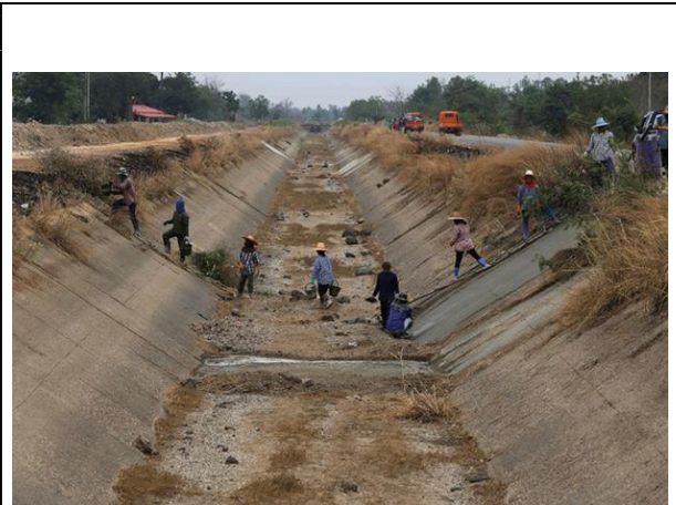
Irrigation canal Chai Nat province, central Thailand, March 2016.

Millions of Asians now confront severe water shortages, and some have been forced to relocate. Myanmar, Thailand, and Cambodia have had to scale back traditional water festivals marking their New Year. The High Court of Bombay moved the world's biggest and wealthiest cricket tournament, the Indian Premier League, out of the state of Maharashtra. In one Maharashtra county, the local authorities, fearing violence, temporarily banned gatherings of more than five people around water storage and supply facilities.