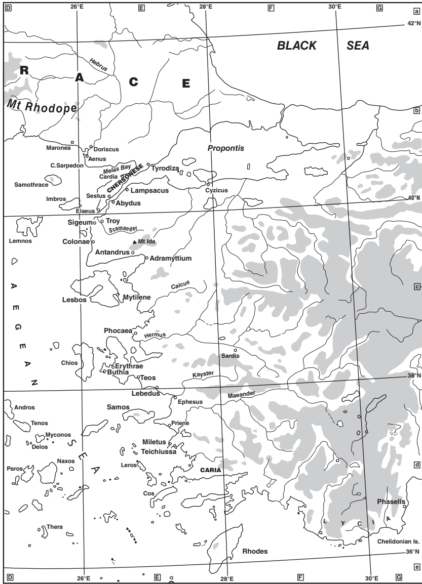
Fig. 2.1 (cont.)