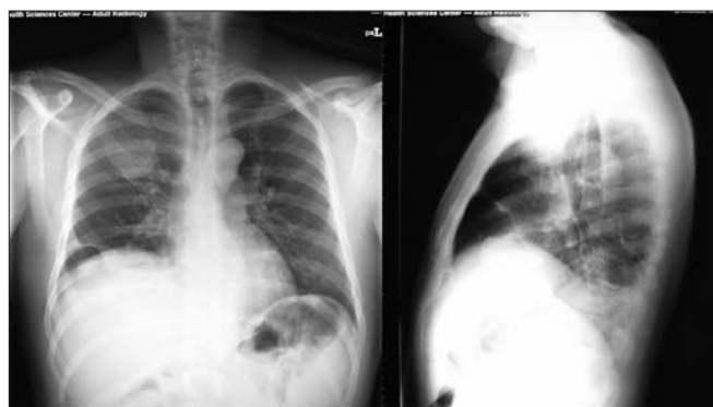
Fig. 1. Anterior–posterior (left) and lateral chest x-ray (right) demonstrating a round opacification in the right upper lobe.

A CBC might be considered as part of the work-up for an infectious etiology because of the history of chills and sweats, but this would not help to localize the focus. While the patient’s ESR might be elevated, like a CBC, it is non-specific. The patient had pectoral swelling, but no ery-