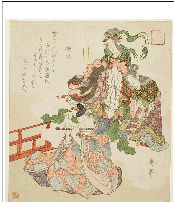
Yashima Gakutei, from the series Ten Courtly Tales for the Honcho Circle , c. 1820