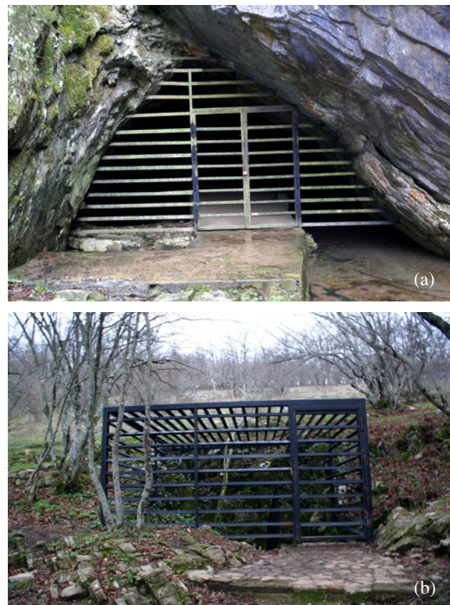
PLATE 1 The gated entrances to (a) Sulu Cave and (b) Kuru Cave, used to control the entry of tourists. The horizontal bars have a spacing of 200 mm to allow bats to move freely.

This is the first cave system in Turkey to open with a visitor schedule and a gate construction based on the seasonal use of the cave system by bats, and long-term monitoring is conducted. The cave system has been visited by nearly 21,000 visitors each year since it was opened to tourism in July 2003; most of the visits occur from late May to July. Tourist circuits have been constructed in the first 200 m of the Sulu Cave and the first 230 m of the Kuru Cave but the Kız Cave is closed to tourism (Fig. 1). The cave system has four entrances. We gated the two entrances to the tourist circuits before the system was opened to tourism. The gates were constructed with horizontal iron bars that have a 200-mm spacing (Plate 1). The other entrances of the cave system, which are located away from