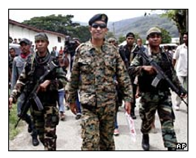
Reinado with rebel soldiers

Gusmao and Ramos Horta refused to move against them, in order to cement the votes they needed - first for Horta to win the presidency, and then for Gusmao's party to form an alliance including PD to take government.