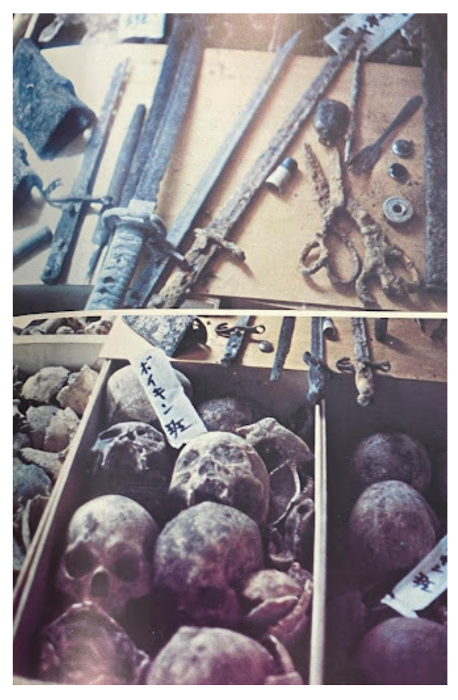
Figure 2: Two photos presented on the same page. The caption to the one above reads: "Mementos of the past." The one to the photo below reads: "while crying ..." (Tōbu Nyūginia senyūkai 1970, 93).

This conceptual framework is particularly useful to the study of discourses and debates about the repatriation of remains. War remains are "sticky objects" par excellence: they prompt from their viewers a somatic response