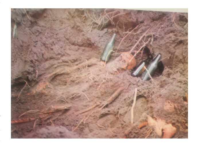
Figure 15: This photograph is captioned: "a body disinterred on the northern beach of Hansa bay. It was probably an officer, the cider bottles left as they were" (Tōbu Nyūginia senyūkai 1970, 61).

shown below, a disinterred skeleton, in a burial place now clearly embedded in the developing root system of a nearby tree, marks the passage of time through the growth of vegetation, and suggests the gradual disappearance of the bodies.