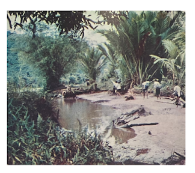
Figure 6: These two photographs are presented next to each other - a wartime American army photograph of New Guinean terrain, and next to it, the New Guinean helpers accompanying the searchers along Francisco creek from Salamaua (Tōbu Nyūginia senyūkai 1970, 26).

In addition, the contrast between wartime photographs and colorful contemporary photographs was a way to highlight a recurring theme in Japanese memoirs of the war in the Pacific: that this hellish war had taken place in a heavenly environment, a lost paradise. In the book, the remains themselves function as the device that ties the monochrome to the colorful, and so the past to the present. The 1969 photographs of skulls, bone fragments and pieces of military equipment excavated during the mission are largely monochrome, not because of the choice of photographic film,