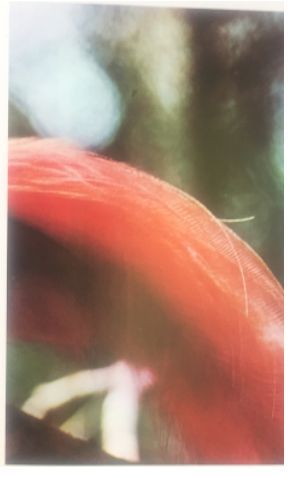
Figure 10: The photograph goes across two pages, with a simple caption: "Bird of Paradise" (Tōbu Nyūginia senyūkai 1970, front page).