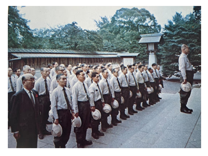
Figure 3: The short caption to this photograph tells us that the fifty-five members of the mission visited Yasukuni Shrine on 3 October 1969, before their departure (Tōbu Nyūginia senyūkai 1970, 15).

carrying backpacks in the heat, looking for their friends, your son, husband, father..." (Tōbu Nyūginia senyūkai 1970, ii). The introduction thus highlights the double sacrifice of the veterans for Japan, the first as soldiers in their youth in an awful battlefield, and the second made again on behalf of families in Japan, despite the veterans' advancing age and the physical toll of the search in tropical heat. This second sacrifice was also made on behalf of the dead themselves: as the introduction states, "going back to visit our dead comrades, whose graves are covered in moss in the middle of the jungle, is the duty of the survivors, and the fulfilment of the oath we took." The duty of survivors to the dead is a common theme of the accounts of those who searched for remains (Happell 2009; Trefalt 2015), and it speaks to their attempt to fulfill the terms of the "implied contract" between Japan and its war dead mentioned earlier.