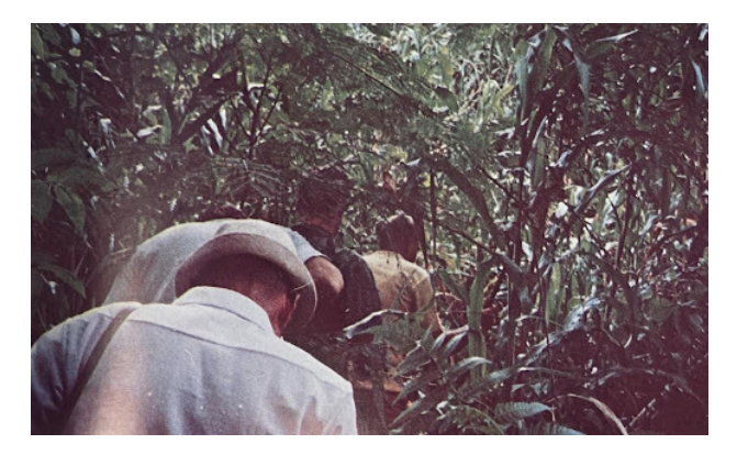
Figure 5: These two photographs are juxtaposed on the same page. The top photograph is captioned: "South of Lae, Kampayama, a forest denuded by Australian bombing (wartime Australian Army photograph)." New Guinean porters are faintly visible bottom right. The photograph underneath is captioned: "members of the search mission push through the jungle, dark even in daytime" (Tōbu Nyūginia senyūkai 1970, 99).

the veterans' perception of the distance between the war and their own present in 1969, symbolized by the juxtaposition of monochrome wartime images with the colorful representation of the same landscape as photographed by the veterans. The wartime photographs are pictures taken by Allied armies: aerial shots of impenetrable mountain ranges, or landscape depictions of swampy river mouths. The veterans took color photographs, twenty-five years later, of similarly impenetrable forests, of fast flowing rivers, and muddy flats, sometimes replicating closely the vista presented by the earlier wartime photographer. The depiction of New Guinea as a hostile natural environment during wartime serves to remind readers of the conditions in which soldiers served at the time. illustrating the common theme in New Guinea veteran memoirs that their enemy was the environment as much as Allied soldiers.