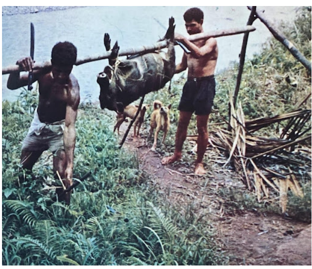
Figure 14: New Guinea men carrying a pig carcass.

searchers. The depiction of two local men transporting between them a pig strung to a pole encompasses all these elements of the photograph book's depiction of New Guineans: exotic, living in "traditional" or "primitive" circumstances, and used to manual labor. Such a contrast between New Guinea and Japan also positions Japan as much further advanced on the scale of modernity, an assumption that Justin Aukema explores in his article in this collection (Aukema, 2022).