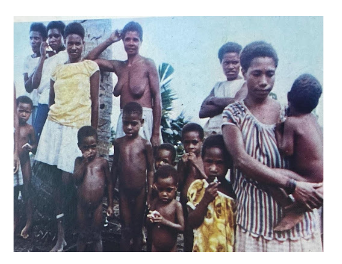
Figure 12: "Women and children of Sonamu village" (Tōbu Nyūginia senyūkai 1970, 55).

For all the grief and mourning that prompted the 1969 mission, it was also in part experienced and presented as tourism, a point which reflects the tension between military deployment and its opportunities for travel. This tension has been explored extensively in research on the deployment of American troops in bases across the world, noting the cognitive dissonance between the imposition, implicitly or explicitly violent, of military occupation, and the pleasurable exploration of other cultures as a leisure activity (Gonzalez, Lipman and others 2016). Debbie Lisle draws attention to the impact of broader global transformation and accompanying discourses on soldiers' experiences of local populations, a point she illustrates with American soldiers' exploitation of women and children during the Cold War (2016, 127). The way in which photographs demonstrate the gaze of privileged individuals at once as soldiers, tourists and voyeurs has been explored by Carolyn O'Dwyer's analysis (2006) of an American album of wartime photographs taken in Saipan. The visit of Japanese veterans to New Guinea in 1969, and their gaze as tourists, resonates with these analyses to some extent, not least because of