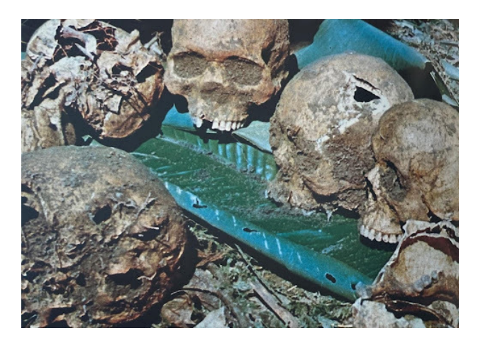
Figure 7: The short caption to this photograph reads: "Young lives, protecting the nation...." (Tōbu Nyūginia senyūkai 1970, 94).

In addition, the contrast between wartime photographs and colorful contemporary photographs was a way to highlight a recurring theme in Japanese memoirs of the war in the Pacific: that this hellish war had taken place in a heavenly environment, a lost paradise. In the book, the remains themselves function as the device that ties the monochrome to the colorful, and so the past to the present. The 1969 photographs of skulls, bone fragments and pieces of military equipment excavated during the mission are largely monochrome, not because of the choice of photographic film,