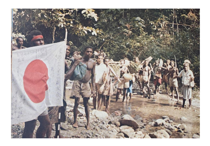
Figure 13: The caption notes: "In the region of Boikin, this is how we went to find the dead every day" (Tōbu Nyūginia senyūkai 1970, 92).

(Australian Government 2020). Nevertheless, the representation of New Guineans in the book of photographs from the 1969 mission, and in Nukuda's memoirs as well, demonstrates their roles for the Japanese mission as guides, carriers and laborer's, as in the illustration below.