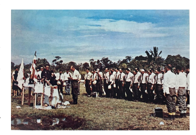
Figure 4: A commemorative ceremony on the site of the former military airport at Malahang, Lae, on 29 October 1969. The

Takeo (later Prime Minister, 1976-78), Foreign Minister Aichi Kiichi, Minister of Defense Arita Kiichi, members of the Upper House, members of the Lower House, representatives of national associations of prefectures and municipalities, as well as important private backers from major railways, banks, the Yasukuni Shrine, and famous figures from the entertainment industry such as wartime and postwar songstress Watanabe Hamako (Tōbu Nyūginia senyūkai 1969). Despite the international reach of the searches for remains, there is no evidence that the New Guinea Association asked for funding outside of Japan. The list of participants in the 1969 mission include a Japanese employee of the Australian Airline Qantas, the airline most likely to service New Guinea at the time, but the terms of his participation are unclear. The colonial administration of New Guinea, the Australian government, certainly acquiesced to the Japanese veterans' visit, especially since preparations for New Guinea's planned 1975 independence included consideration of the potential of Japanese investments in various local industries (Doran 2006).