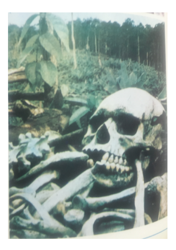
Figure 1: Tōbu Nyūginia senyūkai 1970, 74.

This article analyses the contents of this collection as an attempt to translate the war experience for an audience at home in immediate and emotionally engaging ways. The book was published just a few months after the mission itself. The first few pages consist of an overview of various battlefields in Eastern New Guinea over the three years of the fighting, authored by former Colonel Tanaka Kanegorō (Tōbu Nyūginia senyūkai, 1970). The larger proportion of the book is taken up by the photographs themselves, captioned only by a short sentence if at all, over some 130 pages containing one to three photographs each. They depict the search party, the New Guinean villagers who helped them, and amongst landscapes, animals and plants, also the bones