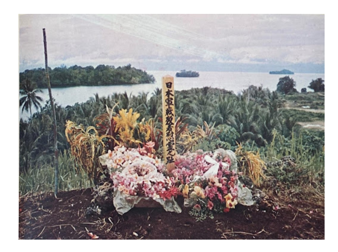
Figure 11: A memorial to Japanese fallen soldiers overlooking the port of Madang (Tōbu Nyūginia senyūkai 1970, 55).