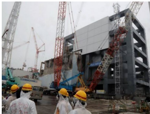
Reporters and Tokyo Electric Power Co workers during a tour of the Fukushima nuclear plant on June 12, 2013