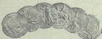
Gold Medal Allahabad 1910.

Paris 1900, Brussels 1910, Buenos Aires 1911.