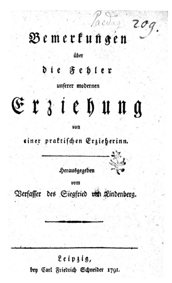
Figure 1 Title page of Observations on the Errors of Our Modern Education

increase in the early 1700s and literacy rose to 25 per cent towards the end of the century. Until the 1750s, most schools were run by the church and taught the septem artes liberales (seven liberal arts), a strict programme of grammar and rhetoric grounded in the recitation of classical texts (Lohmann & Mayer 2007: 116–18). In the mid eighteenth century, reformers began to argue that the church education was no longer fit for the needs of a rapidly growing middle class. Under the direction of Frederick the Great, the state steadily took over the school system. Texts such as Johann Spalding's Consideration of the Vocation of the Human Being (1997 [1748]) and Jean-Jacques Rousseau's Emile, or On Education (1979 [1762]) placed the question of education at the heart of the German Enlightenment. Several prominent voices in the movement, including Johann Christoph Gottsched (1759), ridiculed the Latin system of rhetoric and promoted a new programme of education in the vernacular based on speech and