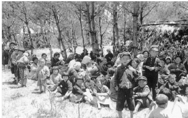
Refugee Children of Jeju, May 1948

the islanders, in contrast to the past decades during which the subject remained strictly taboo in public discourse. The situation has changed since the beginning of the 1990s and nowadays the islanders are free to hold death-anniversary rites for their relatives who were killed or who disappeared in the chaos of 1948. Every April, the whole island turns briefly into a gigantic ritual community consisting of thousands of separate but simultaneous family or community-based events of death commemoration.