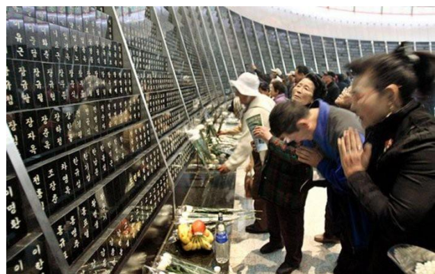
The Chamber of 4.3 Victims, Jeju Peace Park

The 4.3 incident has only recently become a publicly acknowledged historical reality among