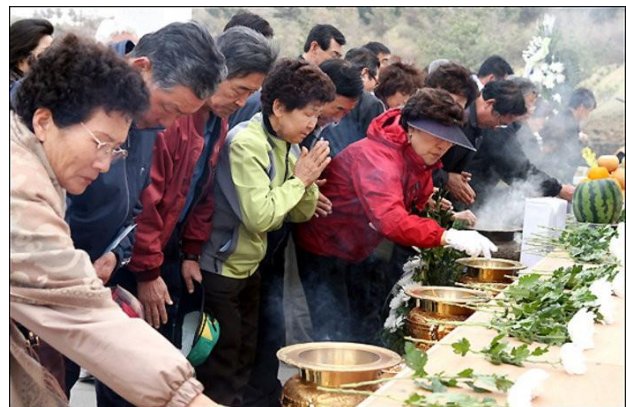
The Commemoration of 4.3 Victims, Jeju Peace Park