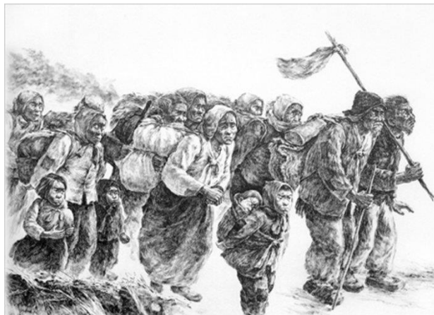
Hillside Villagers Evacuated to the Coastal Area

The 4.3 incident has only recently become a publicly acknowledged historical reality among