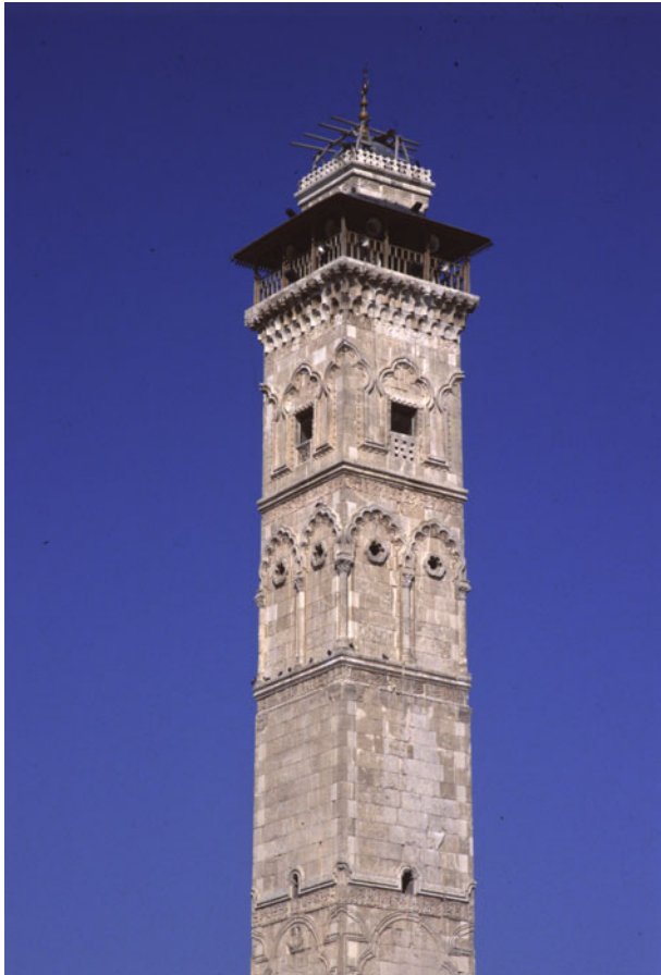
Figure 2. The Seljuk-period minaret of the Great Mosque in Aleppo. Photograph by Ross Burns, 2005.

for its destructive achievements using video clips, posted images and even a glossy monthly English-language magazine, Dabiq , now defunct. IS heralded its arrival by targeting Islamic sites, then ranging further to explore two apparent objectives: to destroy sites associated with the commemoration of the dead, and to eliminate buildings from pre-Islamic cultures, a choice not confined to those displaying human figures. 21