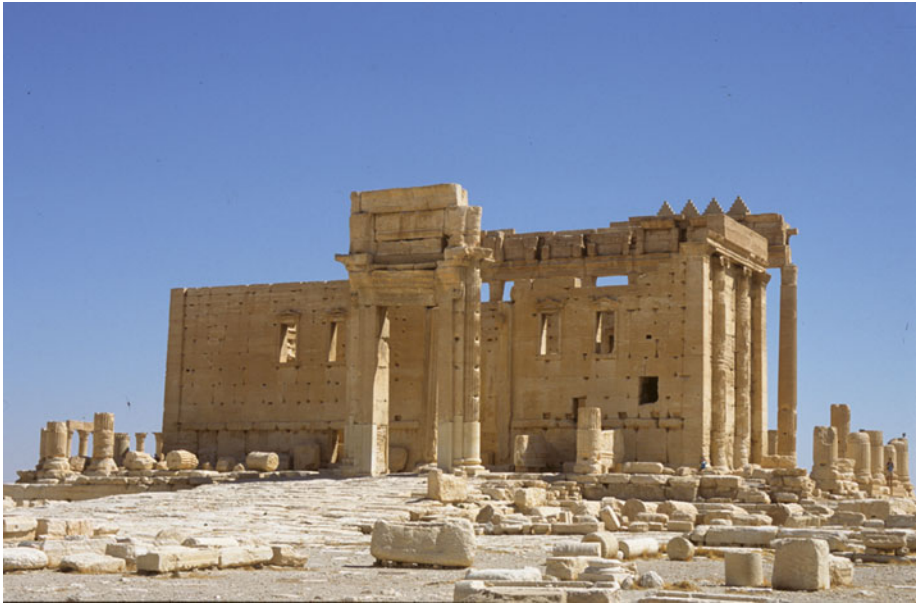
Figure 4. Central shrine ( cella ) of the Temple of Bel, 2004.

as when it withstood the mangonels of Baybars in the late thirteenth century (when its Crusader defenders gave up not because they had lost the protection of their fortified walls but because they had run out of manpower and supplies). Often claims of extensive damage were supported by photos that showed the structures to be in the same condition as they had been in prior to 2011, as seen in this author's own photo resources. 29 The wear and tear of the centuries has often been misinterpreted as damage from hostilities in the civil war.