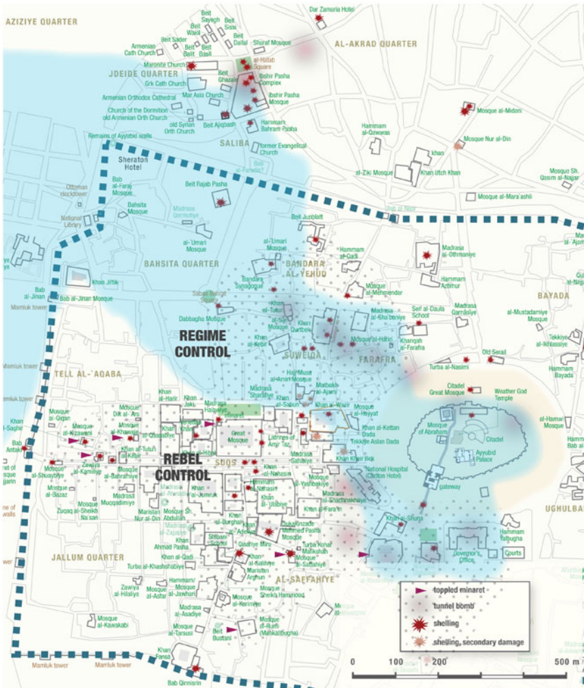
Figure 1. Map of the central historic zone of Aleppo showing locations of intense shelling and tunnel bombs pre-2017. The blue zone indicates control by government forces, red blurred circles indicate tunnel-bombed areas, red flashes show severe rocket damage, and red triangles indicate damaged minarets. Image by Ross Burns, 2017.