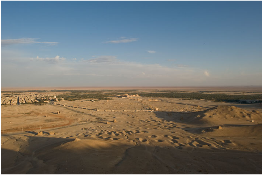
Figure 8. Palmyra seen from Qalaat Shirkuh at the approach of sunset. Photograph by Ross Burns, April 2011.

place in other countries, where authenticity has been sacrificed for tourism or commercial ends.