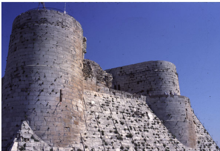
Figure 5. Southern inner defences of Krak des Chevaliers, 1998.

necessarily represent a selective account of the extent of the damage. While such visual comparison cannot replace an on-the-spot report by a structural engineer, the attempt at a provisional tally in relation to Aleppo and Palmyra is reproduced in Figure 6 , with the second column recording the national total of sites or buildings in each category. 31 The figures question to some extent the estimate often given in social media or commentary on the extent of the damage. Though the figures (broken down between national cases and with sub-categories for Aleppo and Palmyra) include a number of high-profile cases of deliberate or large-scale destruction, the last two categories of verified cases involve minor or at least non-structural damage which could be repaired.