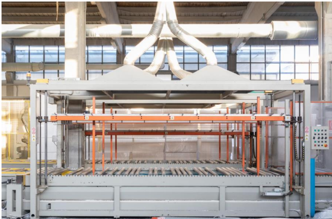
Figure 2. ©Margherita Villani for Young Talent Poliart 2021

In continuous expansion, like a stain, a "virus", it seeks and slowly occupies all the space, repeating itself. Starting from the red thread that follows all my work: that of creating a relationship between seriality, randomness and pictorial gesture, to open a reflection on the theme of reproducibility, we often speak (as I define it) of a "failed reproducibility", because, alongside a construction that refers to the idea of reiteration, of serial possibility, there is an "interruption", the action is "missed", after a first glance we realise that each element, even if similar, maintains its own uniqueness.