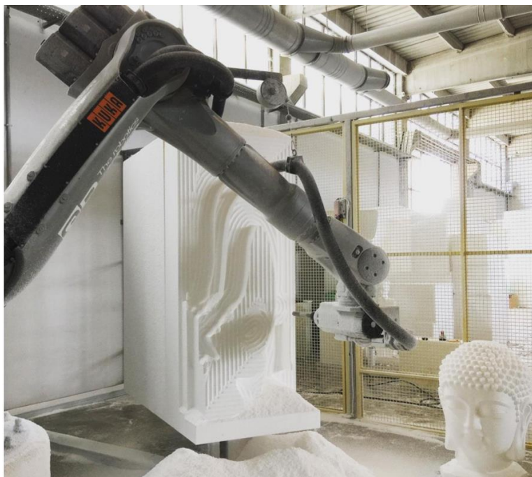
Figure 1. ©Margherita Villani for Young Talent Poliart 2021

The research began with a design phase for a surface with certain aesthetic and functional characteristics, bringing together the artistic and industrial dimensions.