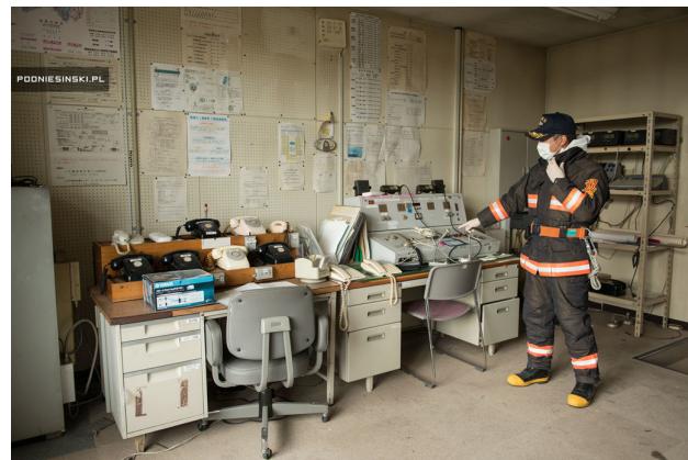
Firefighters' dispatch. Local firefighting tasks in Tomioka were managed from here.

In the spring of this year, thanks to the help and support of many people, particularly the local authorities, evacuated residents and even a monk, I was also able to see many interesting places mostly located in the closed zones in Tomioka, Okuma, Futaba and Namie. Although five years have passed since the disaster, most of them still remain closed and many valuable objects can still be found there. Due to this, I have decided not to publish information that could aid in locating them.