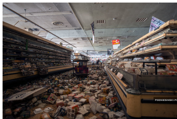
Children's bikes in the courtyard of the kindergarten Supermarket