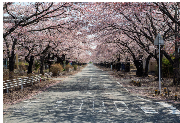
Main street with flowering cherry trees

The nuclear irony of fate meant that this Japanese symbol of new, nascent life today blooms in the contaminated and lifeless streets of Tomioka. Will the city and its residents be reborn, along with the cherry trees blossoming in solitude and silence? Undoubtedly, the last word shall belong to them alone.