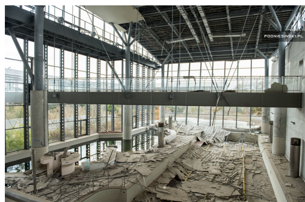
Swimming pool complex Main pool