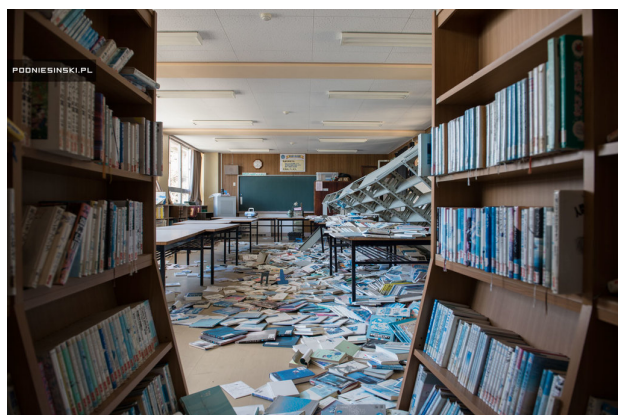
School School library