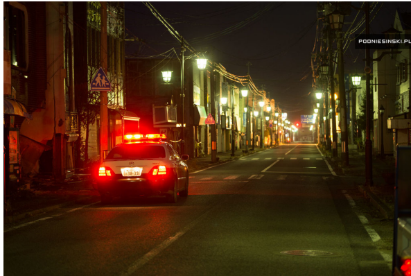
Nighttime police patrol