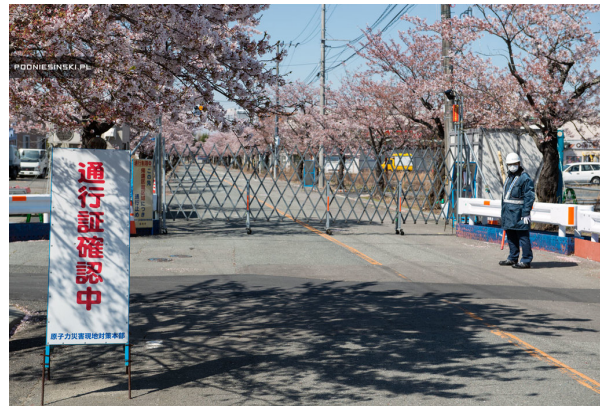
Entrance gate to the closed zone in Tomioka