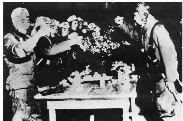
Photograph of send off of a group of Kamikaze found on the body of a pilot shot down in the Solomon Islands. The confident gaze of their commander contrasts with the uncertainty of the kamikaze.

Allied Forces to make concessions so as to end the war as quickly as possible to avoid further Allied casualties by kamikaze attack. However, as testimonies of dead and surviving pilots clearly show, their idea of "country" was far from the nationalistic notion of "nation-state." For most of these young students, "country" meant their own "beautiful hometowns" where their beloved families lived. In this context it is interesting to note that there is very little reference in their wills, letters-home, and diaries of their loyalty to the emperor. Occasionally we find some stereotypical militaristic phrases such as "Kokoku Goji (Uphold the Empire)," "Shinshu Fumetsu (the Immortal Divine Land)," "Yukyu no Taigi (the Noble Cause of Eternal Loyalty)," and the like, but these words are usually used rhetorically rather than conveying deep conviction or abiding nationalistic sentiment.