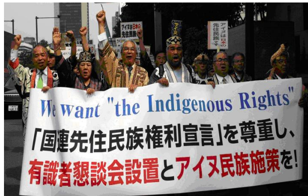
Tokyo: Mass Ainu March for Indigenous Rights, May 22, 2008