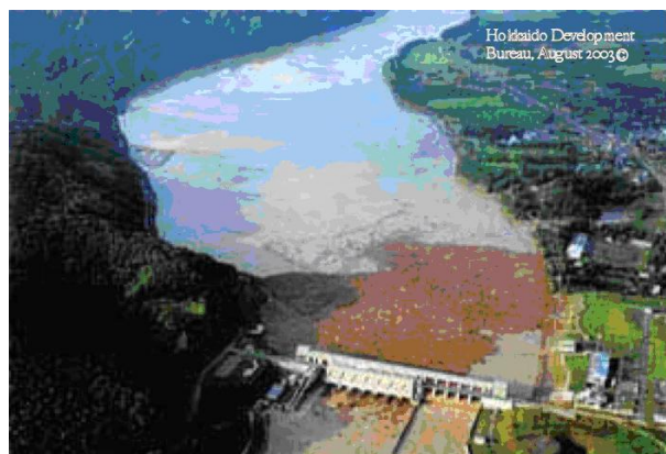
Aerial view of Nibutani Dam, nearly submerged by silt and driftwood during the 2003 typhoon

argue that they have a special mandate to address the global environmental crisis because they are directly dependent on the natural environment for their livelihood, experience immediate consequences when the environment fluctuates, and have observed and experienced global warming-related changes for decades.[49] Mitigation measures now being introduced to combat global warming have also adversely affected indigenous communities in what might be dubbed “neo-energy colonialism.” During the last century, indigenous peoples’ lands were targeted for fossil fuel extraction; now indigenous-managed lands are being targeted for corn, soybean, and oil palm plantations for bioethanol production. [50] Indigenous peoples are experiencing loss of traditional gathering and agricultural lands due to competition with biofuel plantations and hydroelectric dams. [51]