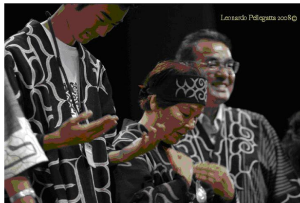
Gestures of thanks from the Executive Council at IPS Start

includes all Ainu...all Ainu communities in Japan, men and women, old and young, rural and urban.”[15]