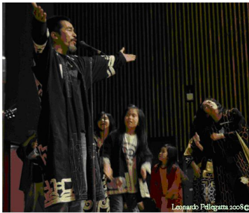
Ainu rock in the family: Ainu Art Project performs traditional songs with hard rock beat