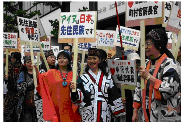
Ainu Women: A vocal majority for indigenous recognition

The Ainu Association also piloted initiatives that were reminiscent of campaigns to support the proposal for the “Ainu New Law” in 1984, which was substantially revised and adopted as the Ainu Cultural Promotion Act (1997), Japan’s first multicultural legislation. Focusing initially on Hokkaido legislators and later expanding to national coalition party leaders, the Association orchestrated visits to legislators, recruiting lawmakers to Ainu political rights work. In March 2008, their efforts bore fruit when the “Legislative Coalition to establish Ainu People’s Rights” was established to push for a resolution “recognizing the Ainu’s pride and dignity as indigenous peoples” ahead of the G8 meetings in July. [24] On May 22, the association coordinated a march on the nation’s capital, attended by more than 400 Ainu from across Japan. Adorned in traditional kimonos and waving placards anticipating the G8 environmental theme, “Ainu are kind to the earth” and “the Earth is on loan from our children,” the group marched toward the Diet buildings. Here Ainu Association directors formally read and delivered a formal request for indigenous rights to assembled lawmakers.