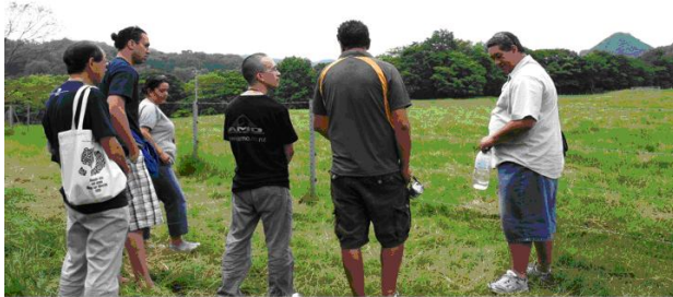
Maori delegation offers a prayer in respect for cinomisir and Ainu ancestors

Saru River Ainu communities for centuries. The proposed Biratori Dam was also a focal point of the Environment workshop. During the IPS fieldwork program, a local Ainu elder led a tour of the dam construction site.