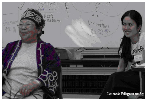
Ukocaranke on Education: Workshops lead to intergenerational discussion