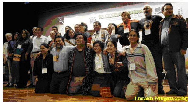
Indigenous Delegates and Ainu organizers at IPS Opening

had a major ripple effect. This impacted not only Ainu people but represents a big step forward for rights reclamation for indigenous people overseas as well." [7]