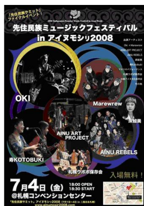
Indigenous Music Festival in Ainu Mosir 2008 poster (Design: W. L. Ding-Everson)

fundamentally unsustainable. The declaration urges non-signatory nations to approve DRIP immediately and asks that indigenous peoples be included in future climate talks and assessments to evaluate the impact of climate mitigation measures. Both documents were submitted to the Ministry of Foreign Affairs for distribution to G8 leaders and posted online. With these appeals now circulating globally, IPS organizers have now begun focusing specifically on recommendations to the government-established Expert Meeting in Japan, because this panel will determine future Ainu policy by July 2009. They will also continue to strengthen international ties established through the IPS to hold the Japanese government accountable to Ainu and fellow minority communities across Japan, and to indigenous peoples worldwide.