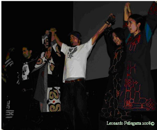
Resistance music: Ainu Rebels blend hip-hop and electronica to create a new Ainu vibe

organized by young Ainu members of the Steering Committee, Ainu youth broke away from the politicized rhetoric of the summit to celebrate ethnic distinctiveness through performance, as an articulation independent of politics.