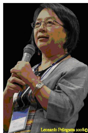
Tauli-Corpuz keynote on indigenous peoples and sustainability

Ainu alignment toward domestic action is in sharp contrast to the focus of IPS indigenous delegates who benefit from treaties and more progressive domestic policies. Many are involved with international organizing and trans-national ventures such as collaboration and leadership training; others serve as leaders of regional indigenous blocks and represent these constituencies in international contexts. They are therefore apprised of the techniques of international law and familiar with the vernacular of international legal-speak. Producing the Nibutani Declaration was an extension of ongoing work on the DRIP for international indigenous leaders.