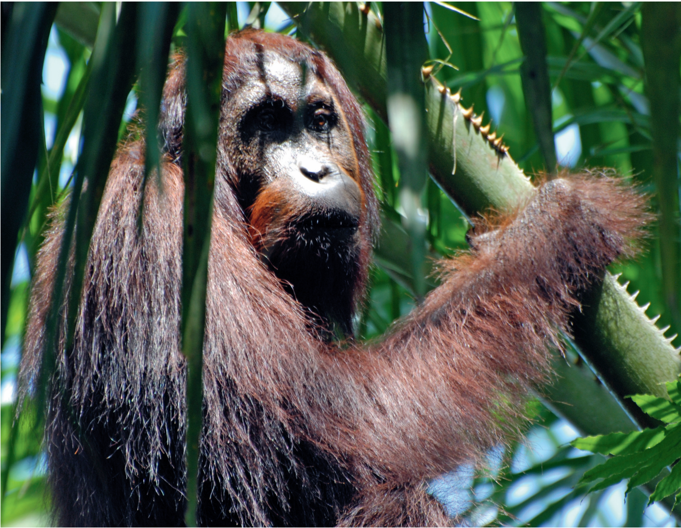
Photo: When species conservation goals conflict with the interests of human individuals and collectives, they can generate difficult moral dilemmas whose resolution requires careful consideration and respect. Orangutan in an oil palm plantation.

of interspecies interdependence, attuned to the flourishing of both humans and animals as members of their ecological communities (Batavia et al. , 2021; Kirby, Steindl and Doty, 2017; Nieuwland, 2020).