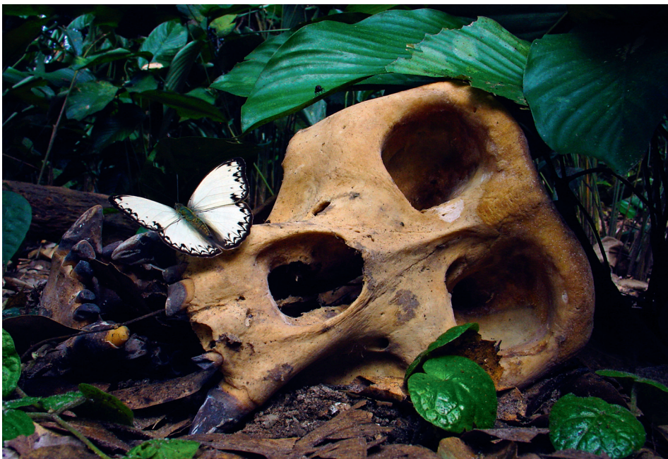
Photo: Some conservation policies implicitly treat individual animals as irrelevant or expendable, while some frame them only in terms of their contribution to the species overall or to other conservation goals. Skull of a western lowland gorilla.

There are many ways to include animals in ethical decision-making. One way is to consider who or what matters morally, and