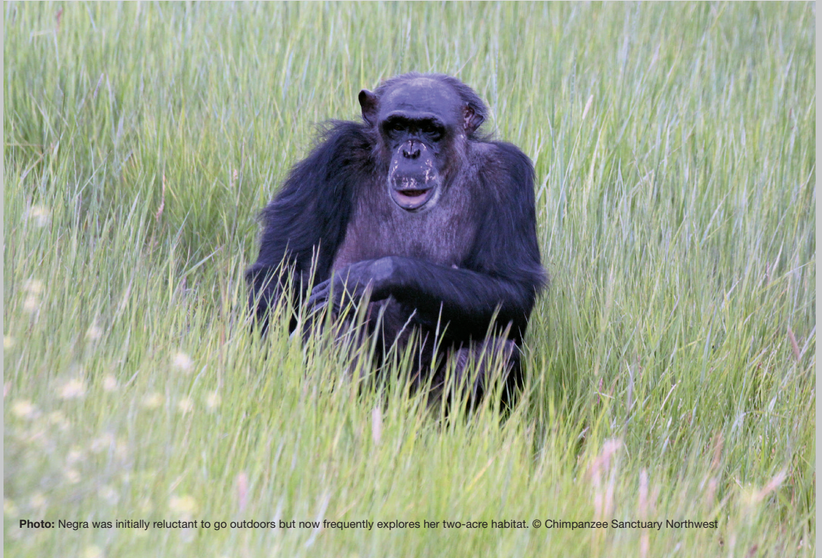
Photo: Negra was initially reluctant to go outdoors but now frequently explores her two-acre habitat.

Beyond the risks and trauma of anesthetic administration, there is the risk of complications from the anesthesia itself. Humans and companion animals set to undergo anesthesia, such as those scheduled for surgery, are often given a pre-anesthetic blood test to evaluate their ability to tolerate the procedure. Such a test is not possible for chimpanzees if the