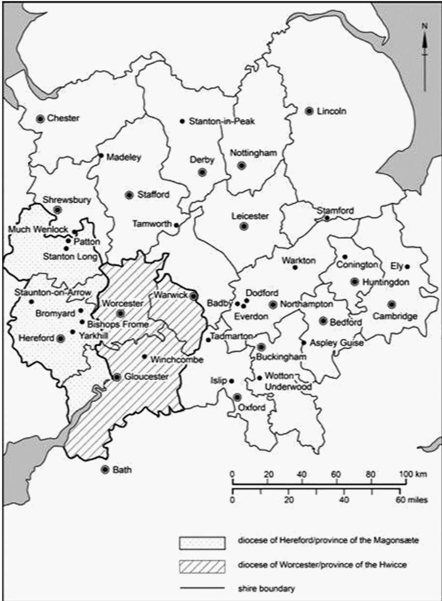
Figure 2: The midland shires in 1086 and, mapped onto them, the contemporary dioceses of Hereford and Worcester, all shown at their estimated extent. The two dioceses arguably mirror the extents of the former Mercian provinces of, respectively, the Magonsæte and the Hwicce. Named places are those referred to in the article. Map by author.