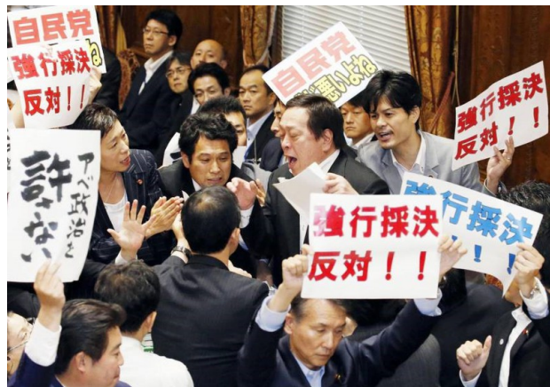
Angry scenes in the National Diet as the governing parties ram through security legislation

Three Principles of Defense Equipment Transfers; revised ODA Charter; revised National Defense Program Guidelines; and currently legislation to enable the exercise of collective self-defense, US-Japan relations (revision of the Defense Guidelines, pushing ahead with the Futenma Replacement Facility; attempts to complete the Trans-Pacific Partnership), and Japan-East Asia relations (historical revisionism in regard to musing on the legitimacy of the Kōno and Murayama statements, and the 2013 visit to Yasukuni Shrine; the pursuit of values-oriented and hyper-active diplomacy; and the 'encirclement' of China). Indeed, for much of Abe's second period in office, this agenda has seemed irresistible as the prime minister has looked to challenge domestic and international taboo after taboo, and thus to finally bring to an end the 'post-war regime' and usher in Japan's return as an autonomous great power, supposedly an equal partner of the US, and a state capable of exercising leadership in East Asia (or a code word for countervailing leadership against China's rising influence).