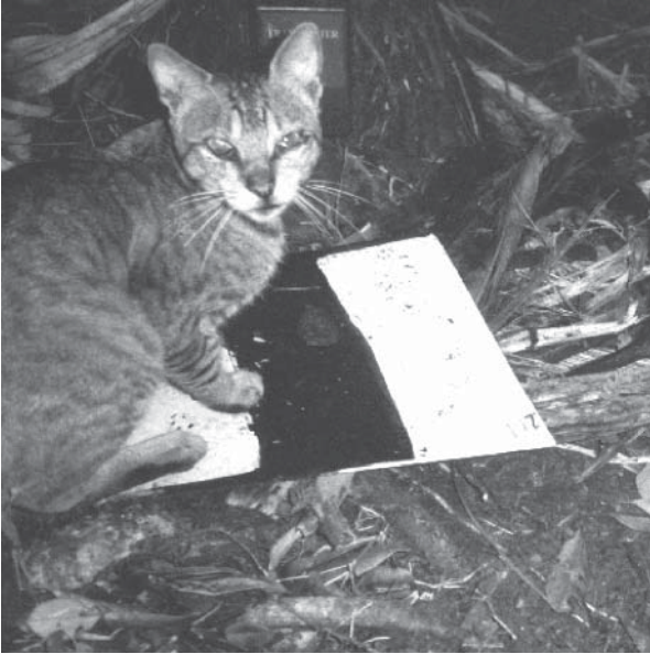
Plate 1 Application of a tracking plate to monitor invasive mammal species in the Caribbean National Forest, Puerto Rico.

per number of traps available, corrected for sprung traps. Rats were euthanized by cervical dislocation.